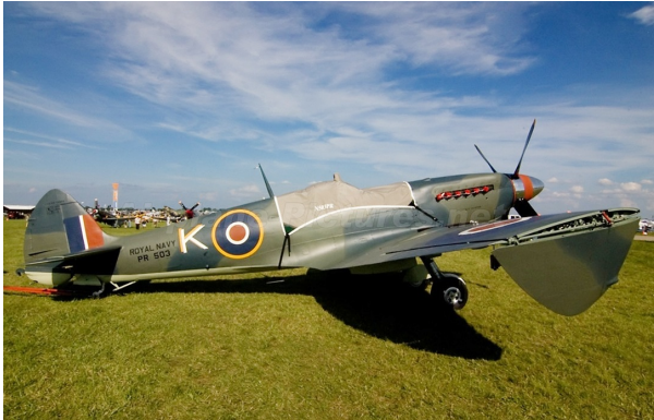
Supermarine Spitfire Mk IX Canopy Cover