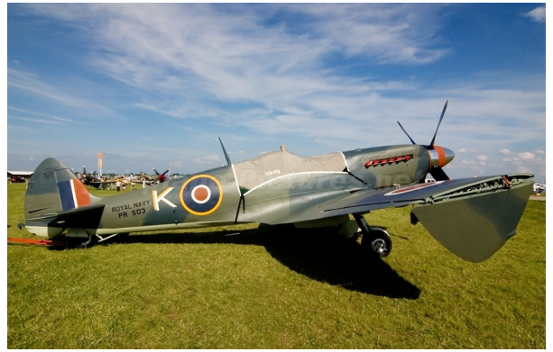
Supermarine Spitfire Mk IX Canopy Cover