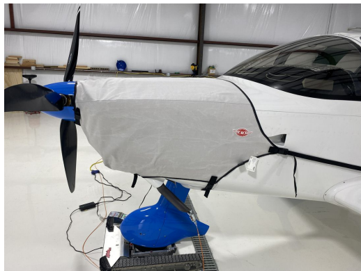
Sling TSI Engine Cover

This cover type is made from Silver Acrylic Sunbrella canvas and is 100% lined with a soft and smooth microfiber. Bruce's Custom Covers developed this material combination especially for aircraft protection. The outer material is medium weight and treated for water resistance, UV resistance and anti-static buildup. The inner lining is a very soft and smooth microfiber to prevent scratching. The material is very reflective, and tests show that the cabin interior temperature can be reduced to near-ambient temperature on the hottest of days. It is water, ice and snow repellent, yet breathable to allow moisture to escape from between the cover and the aircraft surface.