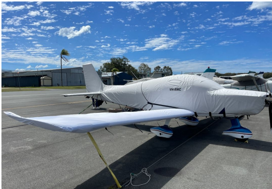
Sling 4 TSi Complete Cover Set

WINTER USE MATERIAL - Made with Solution-Dyed Polyester fabric, this option is intended for seasonal use to aid in deicing, rain mitigation, or for occasional travel. The material is lighter and more compact, but more susceptible to UV damage and may have a shorter useful life if used continuously outside than the all-year use material.