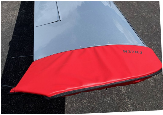
Cirrus SR-22 Wingtip Pads