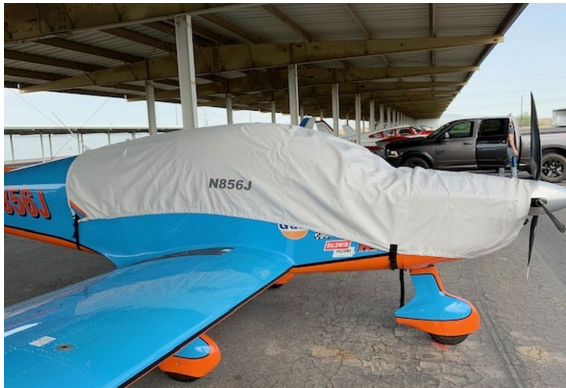
Airplane Factory Sling 4 Canopy/Engine Cover