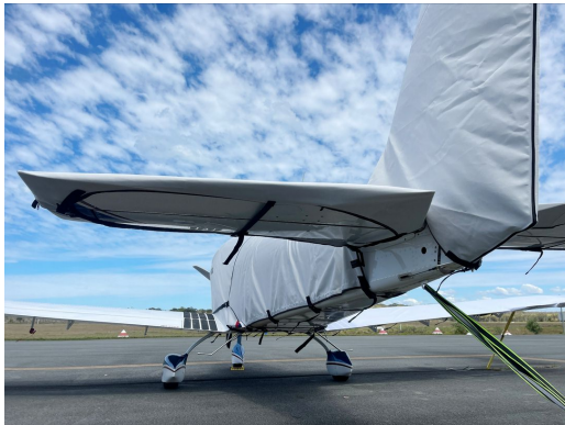
Sling 4 TSi Empennage Cover