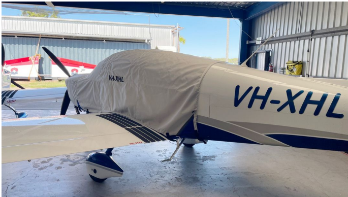
Sling TSI Extended Canopy/Engine Cover

This cover type is made from Silver Acrylic Sunbrella canvas and is 100% lined with a soft and smooth microfiber. Bruce's Custom Covers developed this material combination especially for aircraft protection. The outer material is medium weight and treated for water resistance, UV resistance and anti-static buildup. The inner lining is a very soft and smooth microfiber to prevent scratching. The material is very reflective, and tests show that the cabin interior temperature can be reduced to near-ambient temperature on the hottest of days. It is water, ice and snow repellent, yet breathable to allow moisture to escape from between the cover and the aircraft surface.