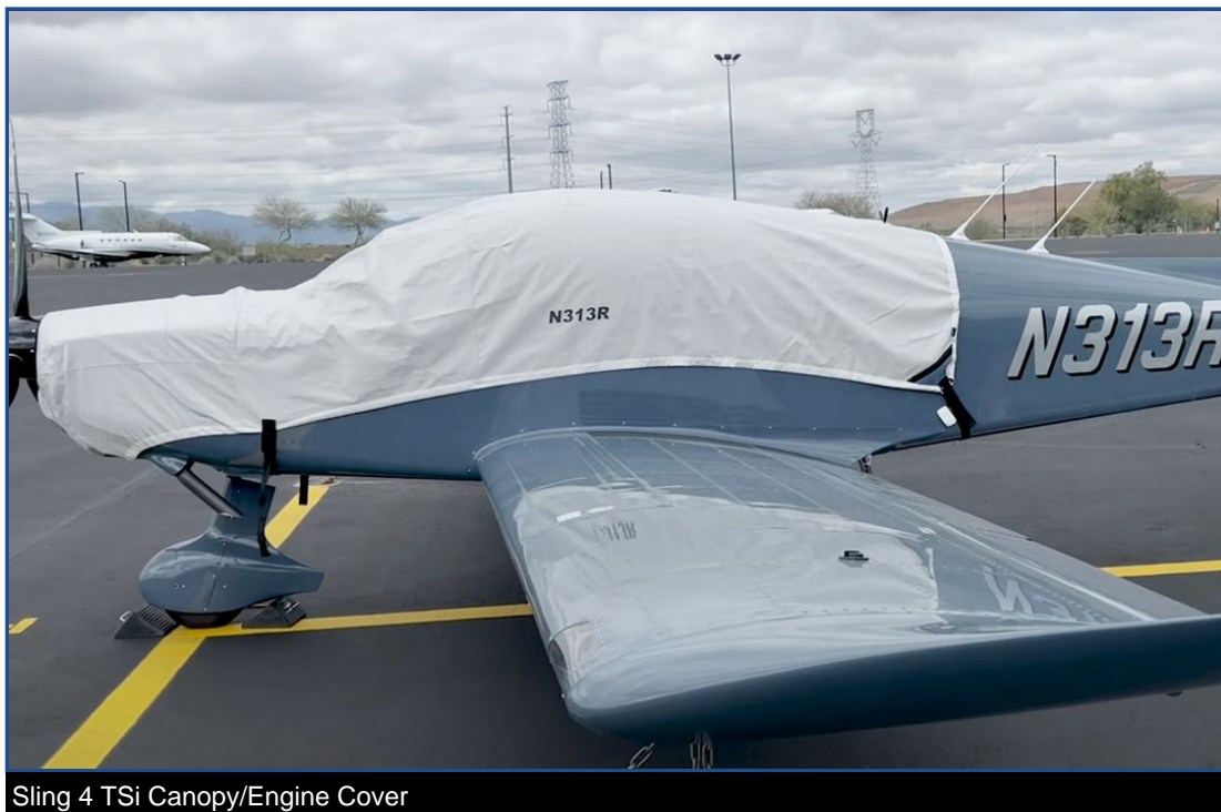
Sling 4 TSi Canopy/Engine Cover