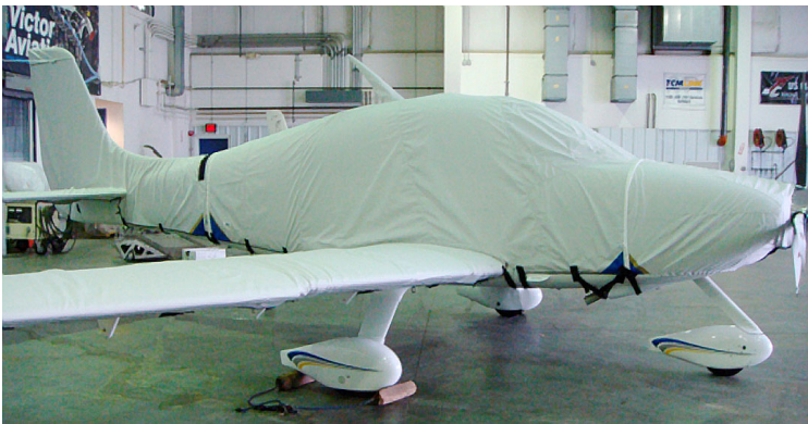
Cirrus SR20 Full Cover Set (Extended Canopy Cover, Engine Cover, Wing Covers, Empennage Cover)