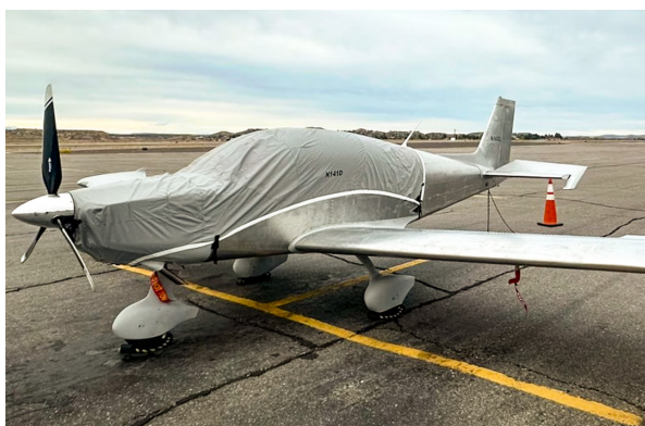
Sling TSi Travel Weight Canopy/Engine Cover

Travel Covers are made with Silver Solution-Dyed Polyester fabric and only lined over the windshield to save weight. The material is lightweight and more compact for easy stowage in the aircraft. The polyester material is water resistant, but only intended for occasional use outside. We also have an ultra lightweight material available for fitted hangar dust covers. For daily outdoor use, the non-travel Sunbrella Cover is the best choice.