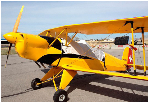
Bucker Jungmann Canopy Cover