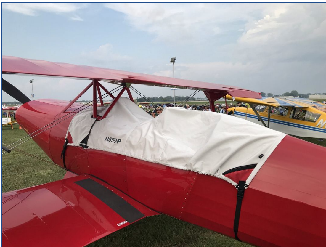
Steen Skybolt Canopy Cover