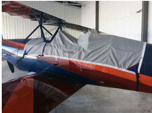
Steen Skybolt Travel Cover

Travel Covers are made with Silver Solution-Dyed Polyester fabric and only lined over the windshield to save weight. The material is lightweight and more compact for easy stowage in the aircraft. The polyester material is water resistant, but only intended for occasional use outside. We also have an ultra lightweight material available for fitted hangar dust covers. For daily outdoor use, the non-travel Sunbrella Cover is the best choice.