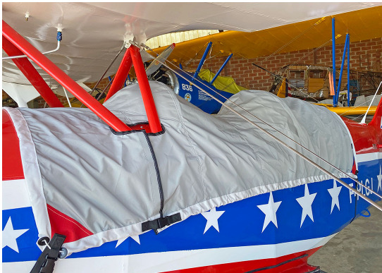
Steen Skybolt Travel Cover, Light Weight Canopy Cover (Specify Open Or Enclosed Cockpit)