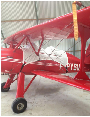
Starduster Too Canopy Cover