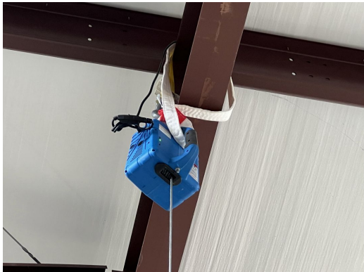
Stearman PT-13 Full Body Dust Cover, Remote Control Winch

Some high value aircraft end up logging lots of hangar time, and become dust magnets in the process. A high quality, well fitting dust cover provides easy assurance that the aircraft's surfaces remain clean and free of grit and grime. Available in a large variety of colors, each dust cover is custom made according to aircraft details and customer preferences. Fire retardant fabrics are also available.