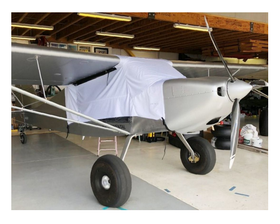
Rans S-20 Canopy Cover, test fit cover