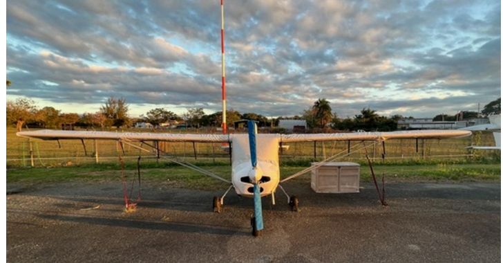
Best Off Skyranger Complete Cover Set