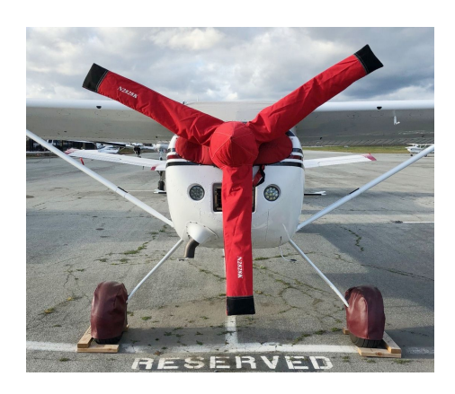
Cessna Skywagon Propellor/Spinner Cover, 3-blade type