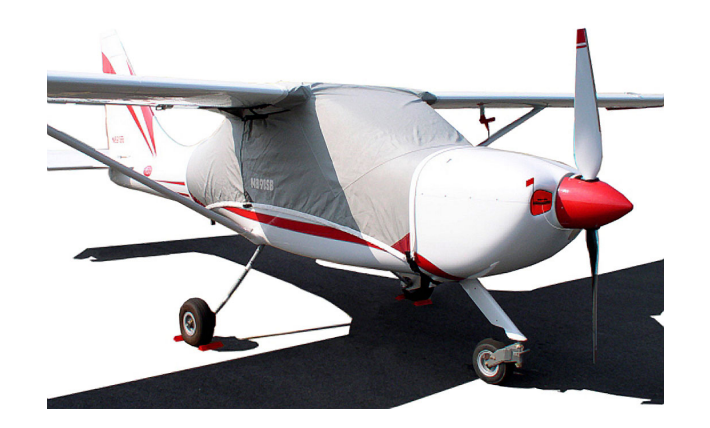
Glastar Over-Top Canopy Cover