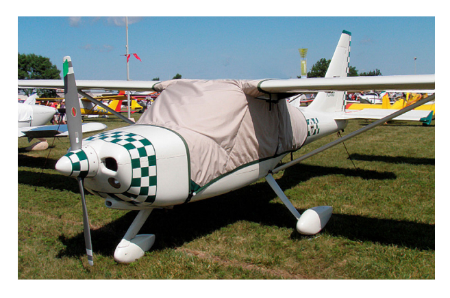
Glastar Over-Top Canopy Cover