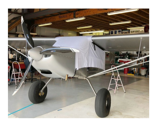
Rans S-20 Canopy Cover, test fit cover