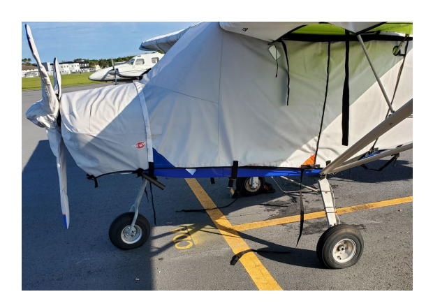
Best Off Skyranger Complete Cover Set