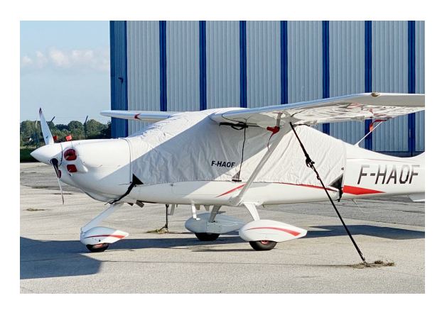
Tecnam P2010 Over-Top Canopy Cover, Engine Plugs