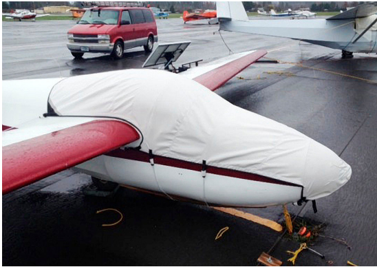
SGS 1-26B Canopy/Nose Cover

The material is very reflective, and tests show that the cabin interior temperature can be reduced to near-ambient temperature on the hottest of days. It is water, ice and snow repellent, yet breathable to allow moisture to escape from between the cover and the aircraft surface.