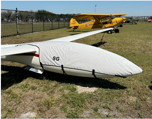
Schreder HP-18 Canopy/Nose Cover