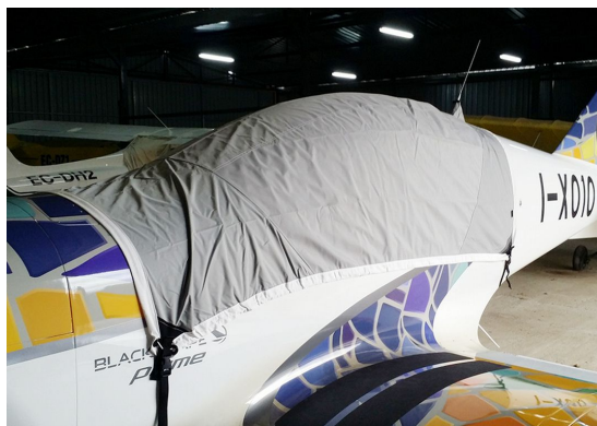
Blackshape Prime Travel Cover, Light Weight Travel Canopy Cover