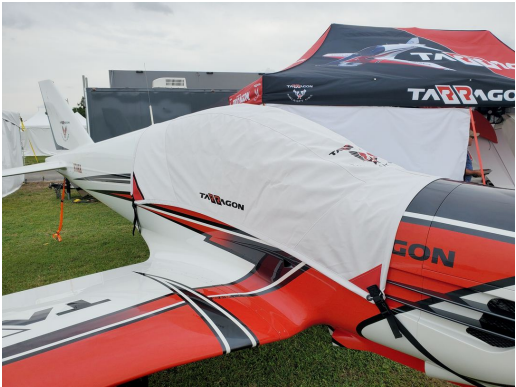
Pelegrin Tarragon Canopy Cover