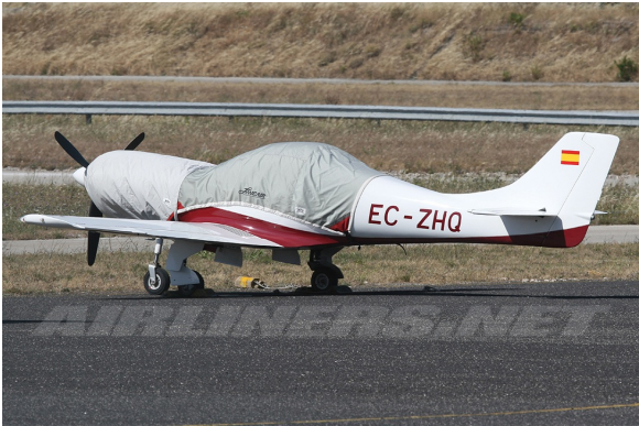
Lancair 360 Canopy Cover, Engine Cover

This cover type is made from Silver Acrylic Sunbrella canvas and is 100% lined with a soft and smooth microfiber. Bruce's Custom Covers developed this material combination especially for aircraft protection. The outer material is medium weight and treated for water resistance, UV resistance and anti-static buildup. The inner lining is a very soft and smooth microfiber to prevent scratching. The material is very reflective, and tests show that the cabin interior temperature can be reduced to near-ambient temperature on the hottest of days. It is water, ice and snow repellent, yet breathable to allow moisture to escape from between the cover and the aircraft surface.