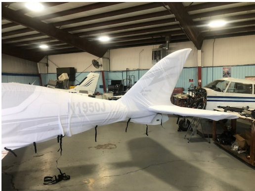
Shark 600 Complete Cover Set, test fit