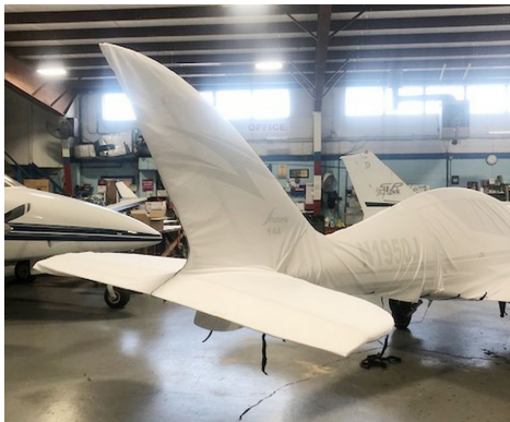
Shark 600 Complete Cover Set, test fit

WINTER USE MATERIAL - Made with Solution-Dyed Polyester fabric, this option is intended for seasonal use to aid in deicing, rain mitigation, or for occasional travel. The material is lighter and more compact, but more susceptible to UV damage and may have a shorter useful life if used continuously outside than the all-year use material.