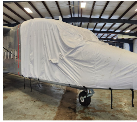
Short Skyvan Forward Fuselage/Nose Cover