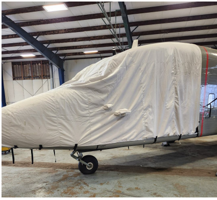
Short Skyvan Forward Fuselage/Nose Cover