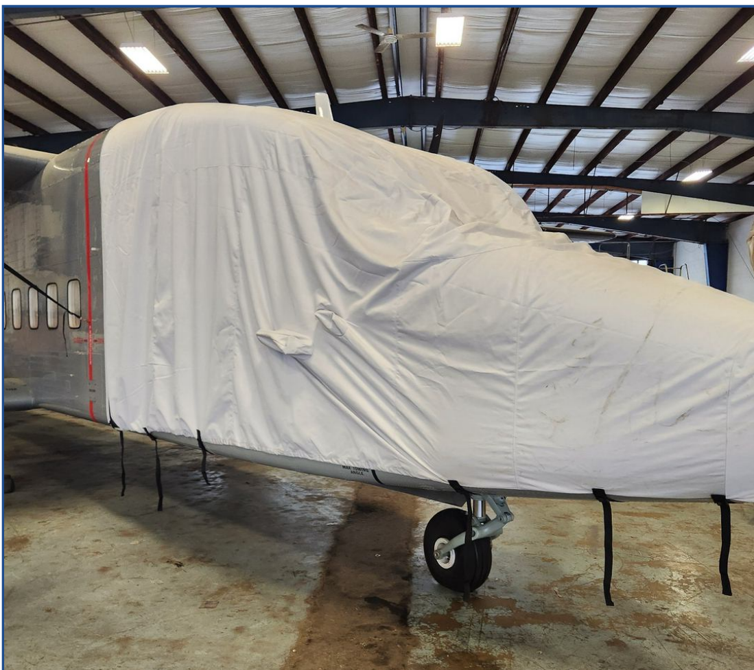
Short Skyvan Forward Fuselage/Nose Cover