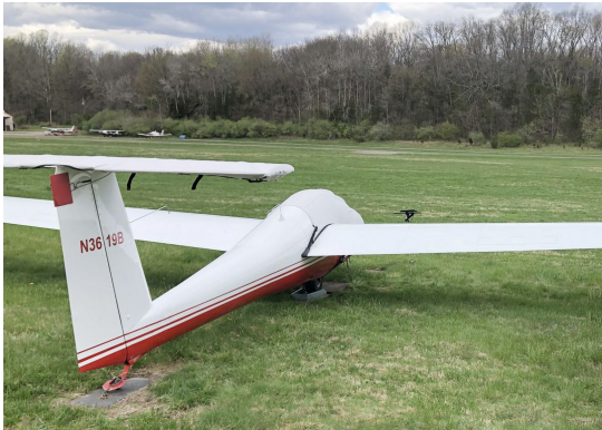
Schweizer 1-36 Canopy & Horiz. Stab. Covers