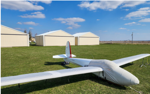
Schweizer 1-26 Canopy/Nose Cover, Wing Covers

WINTER USE MATERIAL - Made with Solution-Dyed Polyester fabric, this option is intended for seasonal use to aid in deicing, rain mitigation, or for occasional travel. The material is lighter and more compact, but more susceptible to UV damage and may have a shorter useful life if used continuously outside than the all-year use material.