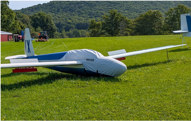
Schweizer 1-23H-15 Canopy/Nose Cover