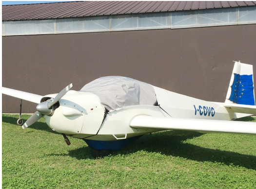
Motorfalke SF25 Lightweight Travel Canopy Cover