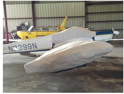
Scheibe Falke SF25 Canopy & Wing Covers