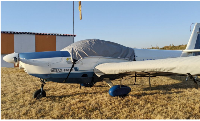
Falke SF-25 C Light Weight Travel Canopy Cover