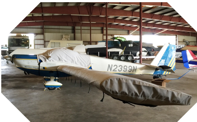
Scheibe Falke SF25 Canopy & Wing Covers