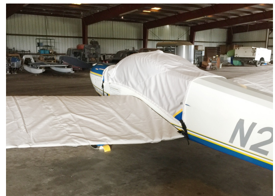
Scheibe Falke SF25 Canopy & Wing Covers