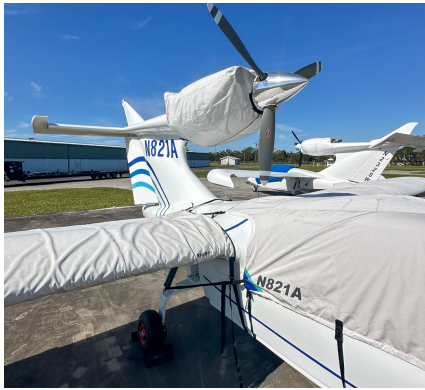
Seawind Seawind 300C & 3000 Amphibian Wing Covers, All Year Use

WINTER USE MATERIAL - Made with Solution-Dyed Polyester fabric, this option is intended for seasonal use to aid in deicing, rain mitigation, or for occasional travel. The material is lighter and more compact, but more susceptible to UV damage and may have a shorter useful life if used continuously outside than the all-year use material.