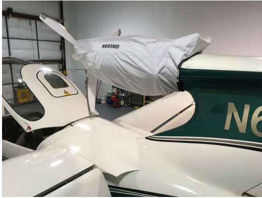
Seawind 3000 Custom Engine Cover

This cover type is made from Silver Acrylic Sunbrella canvas and is 100% lined with a soft and smooth microfiber. Bruce's Custom Covers developed this material combination especially for aircraft protection. The outer material is medium weight and treated for water resistance, UV resistance and anti-static buildup. The inner lining is a very soft and smooth microfiber to prevent scratching. The material is very reflective, and tests show that the cabin interior temperature can be reduced to near-ambient temperature on the hottest of days. It is water, ice and snow repellent, yet breathable to allow moisture to escape from between the cover and the aircraft surface.