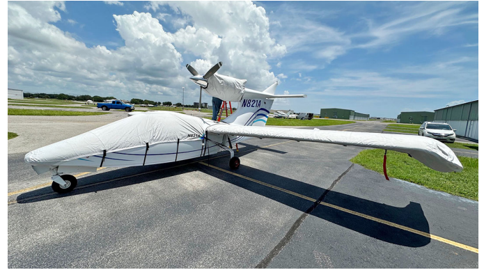
Seawind Seawind 300C & 3000 Amphibian Wing Covers, All Year Use