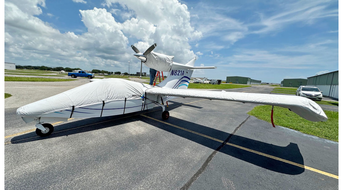
Seawind 3000 Canopy/Nose, Wing & Engine Covers