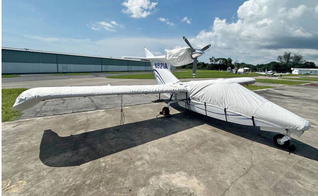
Seawind 3000 Canopy/Nose, Wing & Engine Covers

This cover type is made from Silver Acrylic Sunbrella canvas and is 100% lined with a soft and smooth microfiber. Bruce's Custom Covers developed this material combination especially for aircraft protection. The outer material is medium weight and treated for water resistance, UV resistance and anti-static buildup. The inner lining is a very soft and smooth microfiber to prevent scratching. The material is very reflective, and tests show that the cabin interior temperature can be reduced to near-ambient temperature on the hottest of days. It is water, ice and snow repellent, yet breathable to allow moisture to escape from between the cover and the aircraft surface.