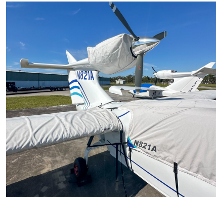
Seawind Seawind 300C & 3000 Amphibian Wing Covers, All Year Use