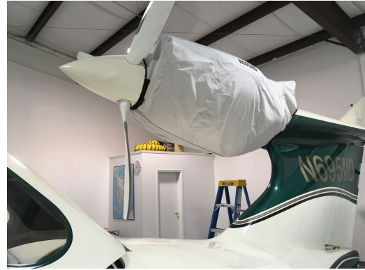
Seawind 3000 Custom Engine Cover