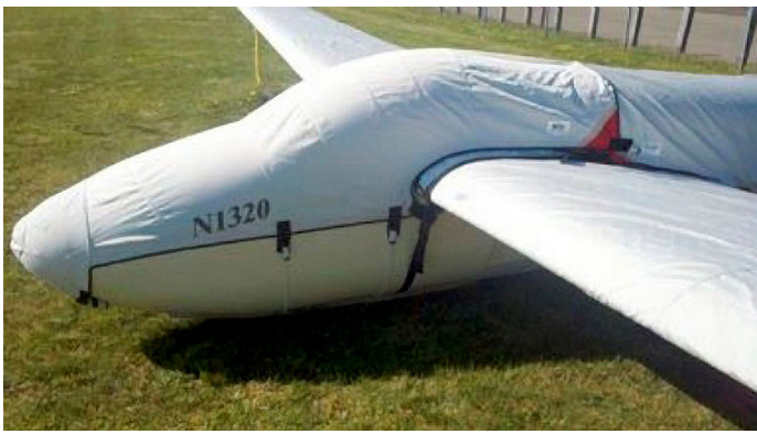
Schweizer SGS 1-26B Canopy/Nose, Wings & Empennage Covers