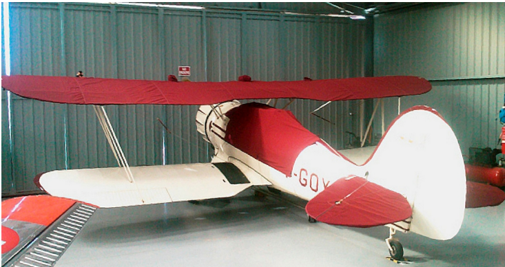
Waco UPF-7 Upper/Lower Wing Cover, Horizontal Stabilizer Cover, & Canopy Cover