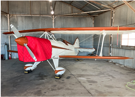
SKYBOLT, Insulated Hangar Blanket, Custom Fit Interior Use)