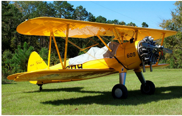
Stearman Canopy Cover