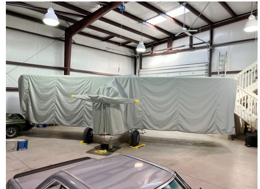
Stearman PT-13 Full Body Dust Cover