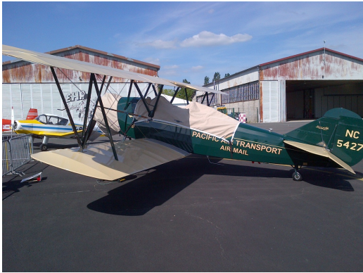
Travelair 4000 Canopy and Engine Cover

the hottest of days. It is water, ice and snow repellent, yet breathable to allow moisture to escape from between the cover and the aircraft surface.