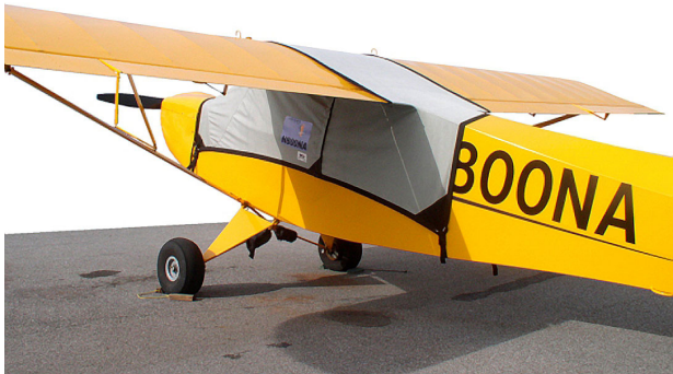
Zlin Savage Over-Top Canopy Cover

This cover type is made from Silver Acrylic Sunbrella canvas and is 100% lined with a soft and smooth microfiber. Bruce's Custom Covers developed this material combination especially for aircraft protection. The outer material is medium weight and treated for water resistance, UV resistance and anti-static buildup. The inner lining is a very soft and smooth microfiber to prevent scratching. The material is very reflective, and tests show that the cabin interior temperature can be reduced to near-ambient temperature on the hottest of days. It is water, ice and snow repellent, yet breathable to allow moisture to escape from between the cover and the aircraft surface.