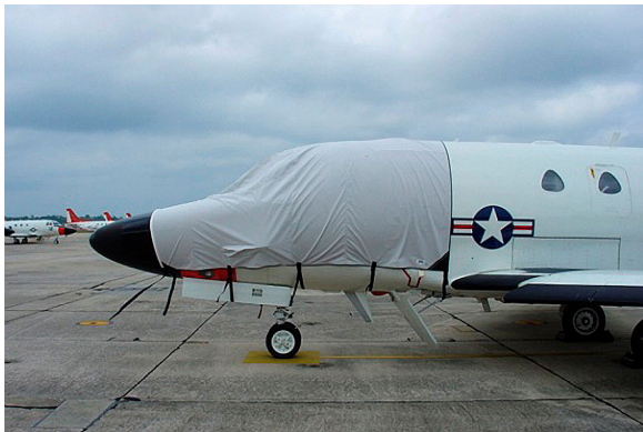
Sabre 40 Cockpit Cover