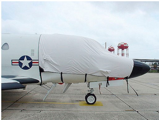
Sabre 40 Cockpit Cover

This cover type is made from Silver Acrylic Sunbrella canvas and is 100% lined with a soft and smooth microfiber. Bruce's Custom Covers developed this material combination especially for aircraft protection. The outer material is medium weight and treated for water resistance, UV resistance and anti-static buildup. The inner lining is a very soft and smooth microfiber to prevent scratching. The material is very reflective, and tests show that the cabin interior temperature can be reduced to near-ambient temperature on the hottest of days. It is water, ice and snow repellent, yet breathable to allow moisture to escape from between the cover and the aircraft surface.