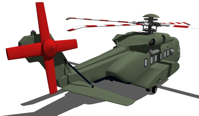
Sikorsky S-92 Tail Rotor Blade and Hub Covers