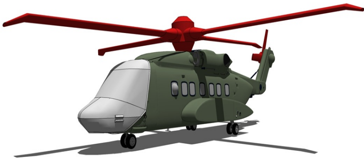
Sikorsky S-92 Windshield/Nose, Blade, Rotor Hub & Tail Rotor Covers

shorter useful life if used continuously outside than the all-year use material.