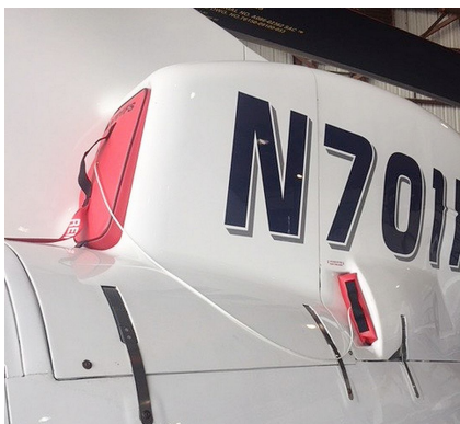
Sikorsky S76 (All Models) Intake Plugs (S76c Models)

The Engine Inlet Plugs are custom fit for your Sikorsky S76 (All Models) intakes, made with heavy-duty vinyl material, and stuffed with a single block of sculpted urethane foam. Each plug has a zipper that allows the foam to be removed and dried if necessary. Engine plugs have 'Remove Before Flight' streamers sewn onto the face of the plugs. Most plugs are imprinted with the aircraft registration number in black for an extra charge. Storage bag NOT included. Engine plugs may be inserted after flight when the engine is still warm. Engine Inlet Plugs are commonly referred to as Cowl Plugs, Intake Plugs, Cowl Blocks, Engine Blocks, and Engine Bungs.