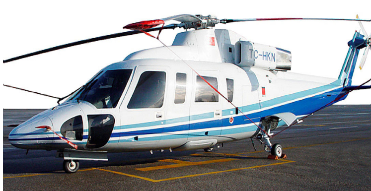
S76 Blade Tie-Downs and Pitot Cover set

WINTER USE MATERIAL - Made with Solution-Dyed Polyester fabric, this option is intended for seasonal use to aid in deicing, rain mitigation, or for occasional travel. The material is lighter and more compact, but more susceptible to UV damage and may have a shorter useful life if used continuously outside than the all-year use material.