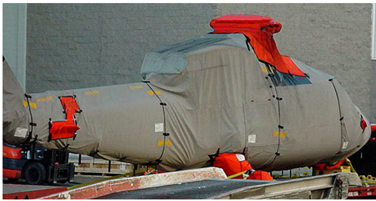
S76 Full Body Transport Cover