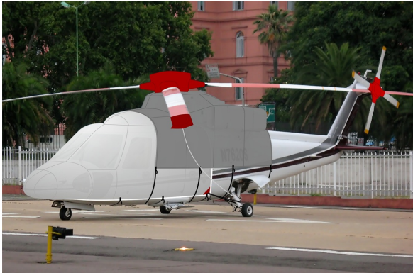
S76 Forward Fuselage, Engine, Main & Tail Rotor Hub Covers (illustration)