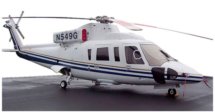
Sikorsky S76 Snap-On Windshield Cover