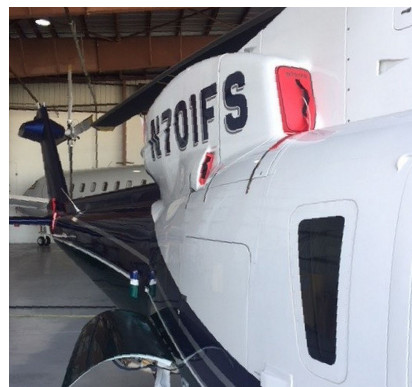
Sikorsky S76 (All Models) Intake Plugs (S76c Models)