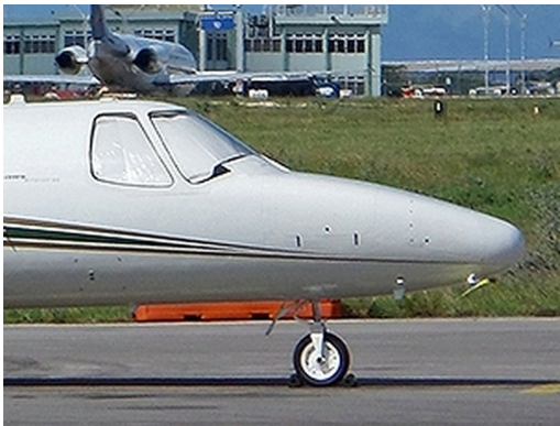
Cessna Citation S550 Cockpit HeatShields