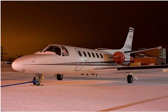
Cessna Citation 550 Engine Cover Set

and dried if necessary. Engine plugs have 'remove before flight' streamers sewn onto the face of the plugs. Most plugs are imprinted with the aircraft registration number in black. Engine plugs may be inserted after flight when the engine is still warm. Engine Inlet Plugs are commonly referred to as Cowl Plugs, Intake Plugs, Cowl Blocks, Engine Blocks, and Engine Bungs.