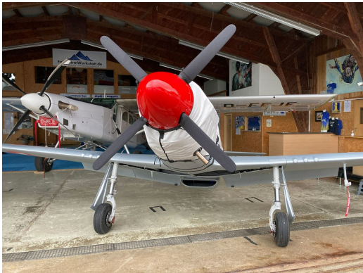
SW-51 Mustang Engine Cover