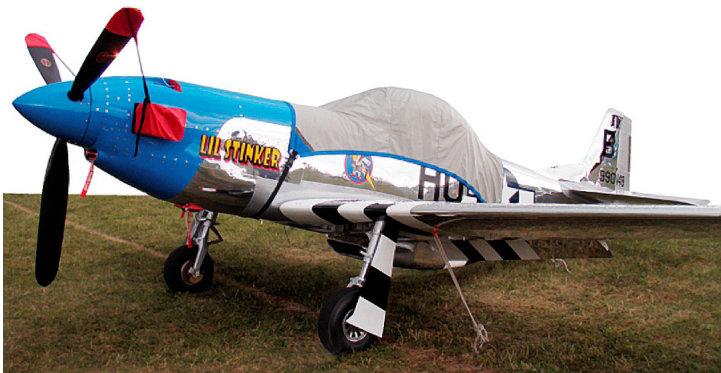
Stewart Mustang Canopy Cover, Prop Tie Downs & Intake Plugs

Covers developed this material combination especially for aircraft protection. The outer material is medium weight and treated for water resistance, UV resistance and anti-static buildup. The inner lining is a very soft and smooth microfiber to prevent scratching. The material is very reflective, and tests show that the cabin interior temperature can be reduced to near-ambient temperature on the hottest of days. It is water, ice and snow repellent, yet breathable to allow moisture to escape from between the cover and the aircraft surface.