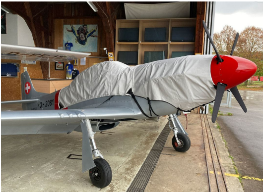
SW-51 Mustang Canopy & Engine Covers