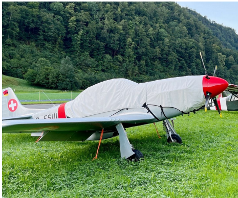
Stewart S-51 Canopy & Engine Covers

This cover type is made from Silver Acrylic Sunbrella canvas and is 100% lined with a soft and smooth microfiber. Bruce's Custom Covers developed this material combination especially for aircraft protection. The outer material is medium weight and treated for water resistance, UV resistance and anti-static buildup. The inner lining is a very soft and smooth microfiber to prevent scratching. The material is very reflective, and tests show that the cabin interior temperature can be reduced to near-ambient temperature on the hottest of days. It is water, ice and snow repellent, yet breathable to allow moisture to escape from between the cover and the aircraft surface.