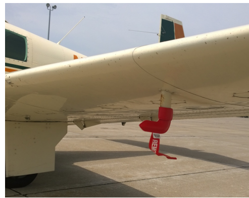
Mooney Pitot Cover