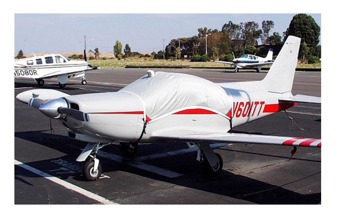
Standard Canopy Cover for Marchetti SF260