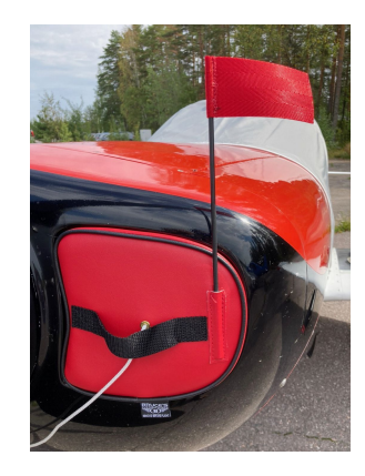
Siai Marchetti SF260 Engine Plugs

Engine Inlet Plugs are custom fit for your Siai Marchetti SF260 intakes, made with heavy-duty vinyl material, and stuffed with a single block of sculpted urethane foam. Each plug has a zipper that allows the foam to be removed and dried if necessary. Engine plugs have warning flags that are visible from the cockpit or 'remove before flight' streamers sewn onto the face of the plugs. Most plugs are imprinted with the aircraft registration number in black for an extra charge. Storage bag NOT included. Engine plugs may be inserted after flight when the engine is still warm. Engine Inlet Plugs are commonly referred to as Cowl Plugs, Intake Plugs, Cowl Blocks, Engine Blocks, and Engine Bungs.