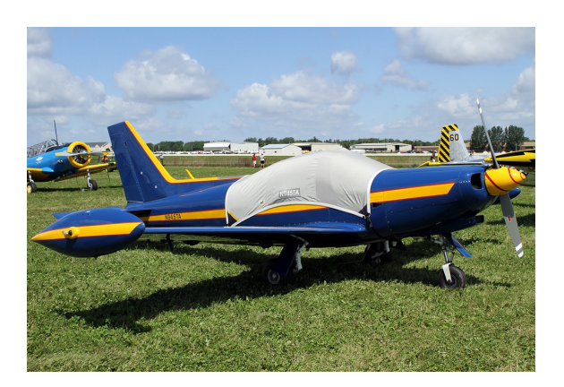
Siai Marchetti SF260 Canopy Cover