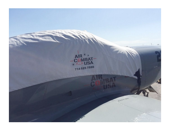
1974 Siai-Marchetti SF 260B Canopy Cover with customized Imprint

This cover type is made from Silver Acrylic Sunbrella canvas and is 100% lined with a soft and smooth microfiber. Bruce's Custom Covers developed this material combination especially for aircraft protection. The outer material is medium weight and treated for water resistance, UV resistance and anti-static buildup. The inner lining is a very soft and smooth microfiber to prevent scratching. The material is very reflective, and tests show that the cabin interior temperature can be reduced to near-ambient temperature on the hottest of days. It is water, ice and snow repellent, yet breathable to allow moisture to escape from between the cover and the aircraft surface.