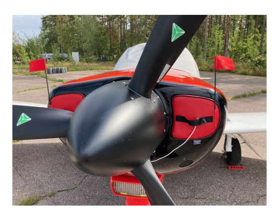
Siai Marchetti SF260 Engine Plugs