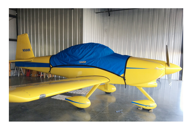
Van's RV-8/8A Travel Cover