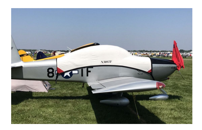
Van's RV-8 Canopy Cover

This cover type is made from Silver Acrylic Sunbrella canvas and is 100% lined with a soft and smooth microfiber. Bruce's Custom Covers developed this material combination especially for aircraft protection. The outer material is medium weight and treated for water resistance, UV resistance and anti-static buildup. The inner lining is a very soft and smooth microfiber to prevent scratching. The material is very reflective, and tests show that the cabin interior temperature can be reduced to near-ambient temperature on the hottest of days. It is water, ice and snow repellent, yet breathable to allow moisture to escape from between the cover and the aircraft surface.