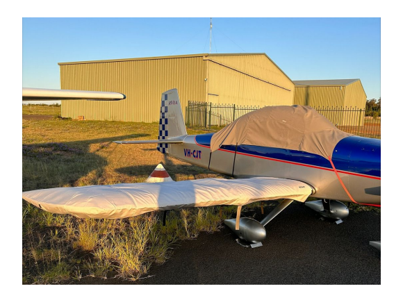
Van's Aircraft RV-8/8A Wing Covers, All Year Use

WINTER USE MATERIAL - Made with Solution-Dyed Polyester fabric, this option is intended for seasonal use to aid in deicing, rain mitigation, or for occasional travel. The material is lighter and more compact, but more susceptible to UV damage and may have a shorter useful life if used continuously outside than the all-year use material.