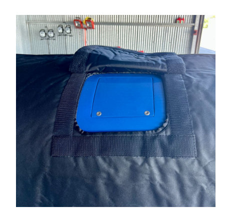
Van's RV8 Insulated Engine Cover