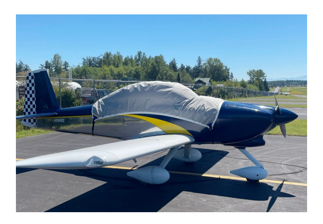
RV-8A Travel Canopy Cover

Travel Covers are made with Silver Solution-Dyed Polyester fabric and only lined over the windshield to save weight. The material is lightweight and more compact for easy stowage in the aircraft. The polyester material is water resistant, but only intended for occasional use outside. We also have an ultra lightweight material available for fitted hangar dust covers. For daily outdoor use, the non-travel Sunbrella Cover is the best choice.