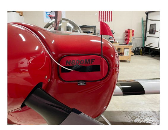
Van's RV-8 Engine Inlet Plugs