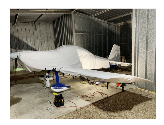
Van's RV-8 Complete Fuselage Cover with Detachable Wing Covers