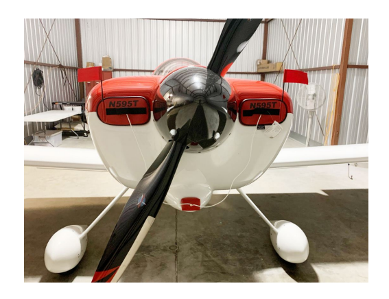
Van's RV-8 Engine Inlet Plugs

Engine Inlet Plugs are custom fit for your Van's Aircraft RV-8/8A intakes, made with heavy-duty vinyl material, and stuffed with a single block of sculpted urethane foam. Each plug has a zipper that allows the foam to be removed and dried if necessary. Engine plugs have warning flags that are visible from the cockpit or 'remove before flight' streamers sewn onto the face of the plugs. Most plugs are imprinted with the aircraft registration number in black for an extra charge. Storage bag NOT included. Engine plugs may be inserted after flight when the engine is still warm. Engine Inlet Plugs are commonly referred to as Cowl Plugs, Intake Plugs, Cowl Blocks, Engine Blocks, and Engine Bungs.