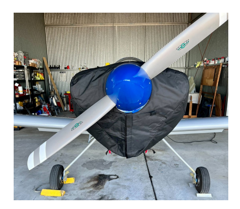
Van's RV8 Insulated Engine Cover

This cover type is made from Silver Acrylic Sunbrella canvas and is 100% lined with a soft and smooth microfiber. Bruce's Custom Covers developed this material combination especially for aircraft protection. The outer material is medium weight and treated for water resistance, UV resistance and anti-static buildup. The inner lining is a very soft and smooth microfiber to prevent scratching. The material is very reflective, and tests show that the cabin interior temperature can be reduced to near-ambient temperature on the hottest of days. It is water, ice and snow repellent, yet breathable to allow moisture to escape from between the cover and the aircraft surface.