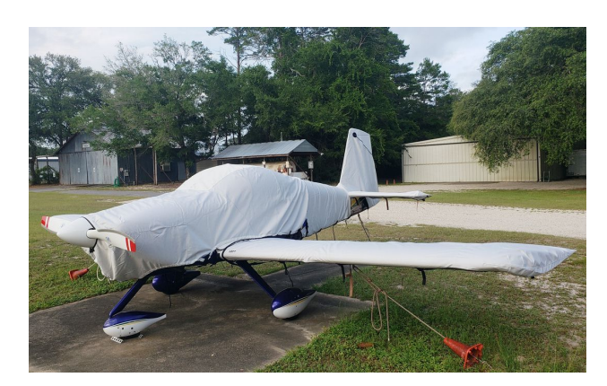
Van's RV-7A Cover Set

This cover type is made from Silver Acrylic Sunbrella canvas and is 100% lined with a soft and smooth microfiber. Bruce's Custom Covers developed this material combination especially for aircraft protection. The outer material is medium weight and treated for water resistance, UV resistance and anti-static buildup. The inner lining is a very soft and smooth microfiber to prevent scratching. The material is very reflective, and tests show that the cabin interior temperature can be reduced to near-ambient temperature on the hottest of days. It is water, ice and snow repellent, yet breathable to allow moisture to escape from between the cover and the aircraft surface.