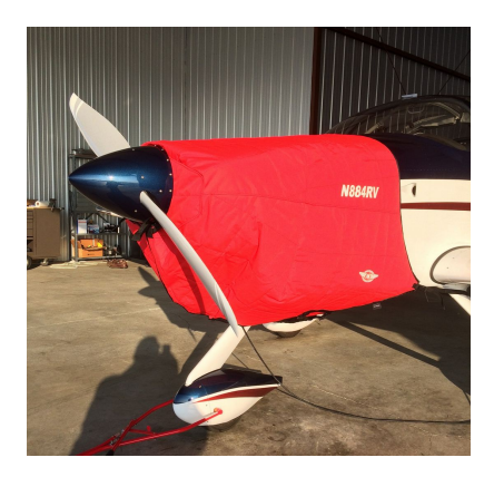
Van's RV-9A Insulated Engine Cover