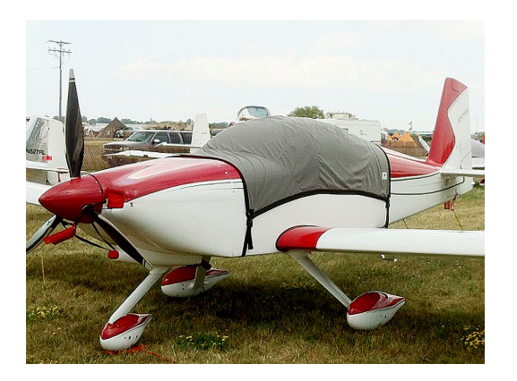
Van's RV-9 Travel Canopy Cover