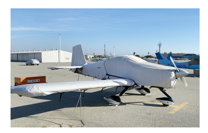
Van's RV-9A Extended Canopy/Engine, Wing & Empennage Covers

WINTER USE MATERIAL - Made with Solution-Dyed Polyester fabric, this option is intended for seasonal use to aid in deicing, rain mitigation, or for occasional travel. The material is lighter and more compact, but more susceptible to UV damage and may have a shorter useful life if used continuously outside than the all-year use material.