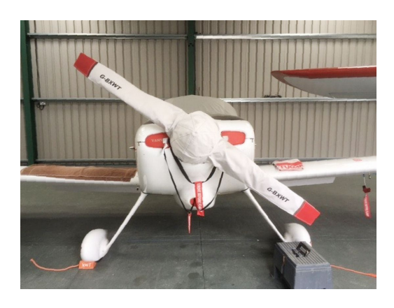
Van's RV-6 Prop/Spinner Cover