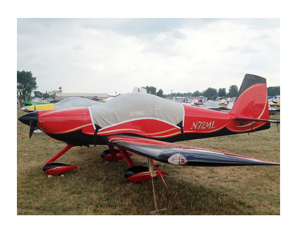
Van's RV-7 Canopy Cover