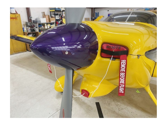
Van's Aircraft RV-7 Engine Inlet Plugs