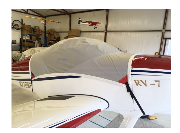
Van's RV-7 Travel Canopy Cover

Travel Covers are made with Silver Solution-Dyed Polyester fabric and only lined over the windshield to save weight. The material is lightweight and more compact for easy stowage in the aircraft. The polyester material is water resistant, but only intended for occasional use outside. We also have an ultra lightweight material available for fitted hangar dust covers. For daily outdoor use, the non-travel Sunbrella Cover is the best choice.