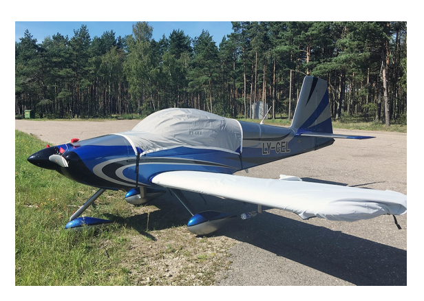
Van's RV-7/7A Travel and Wing Covers