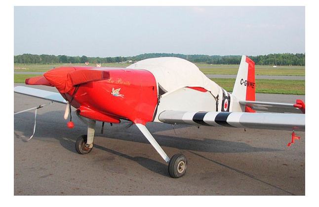
Van's RV-6 2-Blade Prop Cover

This cover type is made from Silver Acrylic Sunbrella canvas and is 100% lined with a soft and smooth microfiber. Bruce's Custom Covers developed this material combination especially for aircraft protection. The outer material is medium weight and treated for water resistance, UV resistance and anti-static buildup. The inner lining is a very soft and smooth microfiber to prevent scratching. The material is very reflective, and tests show that the cabin interior temperature can be reduced to near-ambient temperature on the hottest of days. It is water, ice and snow repellent, yet breathable to allow moisture to escape from between the cover and the aircraft surface.