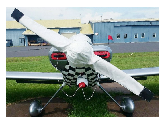
Van's RV-3 Engine Plugs, Prop/Spinner Cover