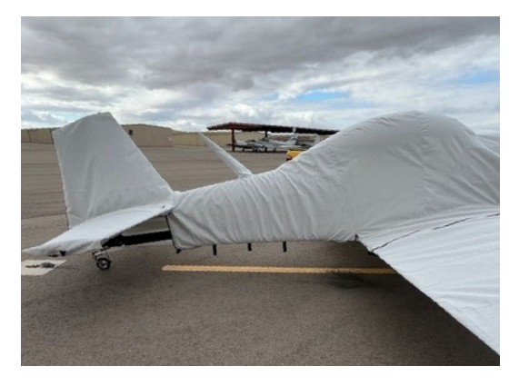
Vans RV-8 Complete Cover Set