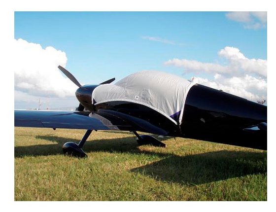
Harmon Rocket Canopy Cover