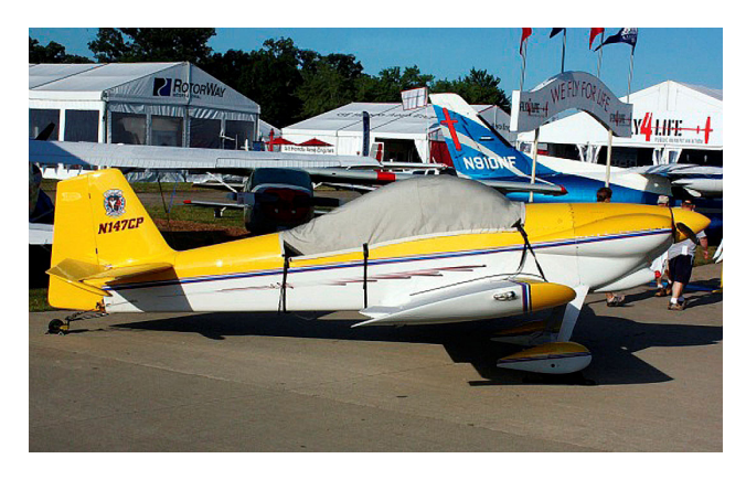
Van's RV-4 Canopy Cover

This cover type is made from Silver Acrylic Sunbrella canvas and is 100% lined with a soft and smooth microfiber. Bruce's Custom Covers developed this material combination especially for aircraft protection. The outer material is medium weight and treated for water resistance, UV resistance and anti-static buildup. The inner lining is a very soft and smooth microfiber to prevent scratching. The material is very reflective, and tests show that the cabin interior temperature can be reduced to near-ambient temperature on the hottest of days. It is water, ice and snow repellent, yet breathable to allow moisture to escape from between the cover and the aircraft surface.