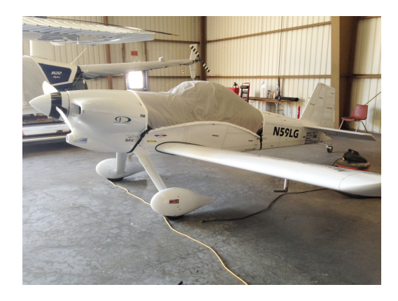
Van's RV-3 Light Weight Travel Cover