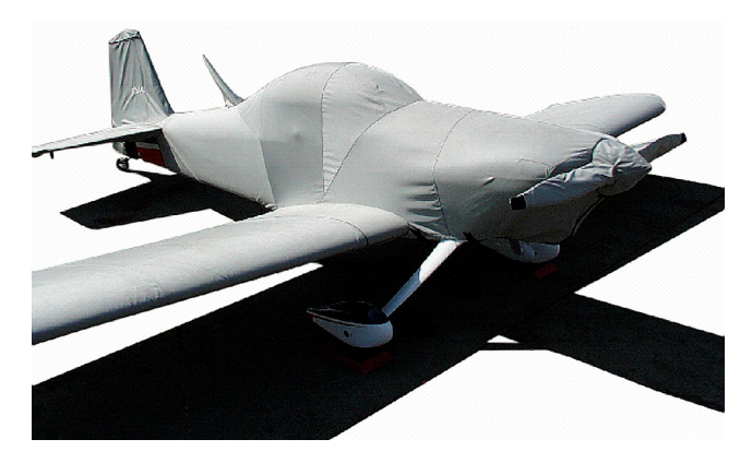
Van's RV-7 Insulated Engine Cover