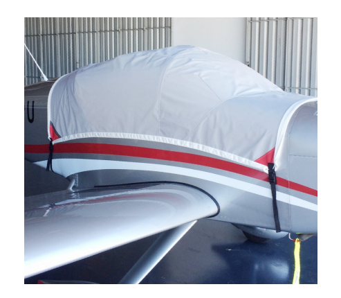
Vans's RV-9 Light Weight Travel Canopy Cover

Travel Covers are made with Silver Solution-Dyed Polyester fabric and only lined over the windshield to save weight. The material is lightweight and more compact for easy stowage in the aircraft. The polyester material is water resistant, but only intended for occasional use outside. We also have an ultra lightweight material available for fitted hangar dust covers. For daily outdoor use, the non-travel Sunbrella Cover is the best choice.