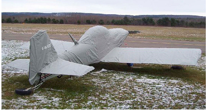
Vans's RV-3 Canopy Cover