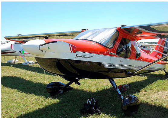
Glastar Sportsman Windshield HeatShield

Windshield Heatshields are interior sunshades for an aircraft's front windshield. The product is a unique composite of closed-cell foam with a silver mylar finish. The semi-rigid design is stiff enough to stand along the inside of the windshield using sun visors or window framing. It folds up flat and easily stores in the included storage sleeve. Some designs may require velcro and suction cups or split right and left sides. A Heatshield is an excellent short-term remedy for cockpit overheating. An external fabric cover is far more effective and practical for long-term protection.