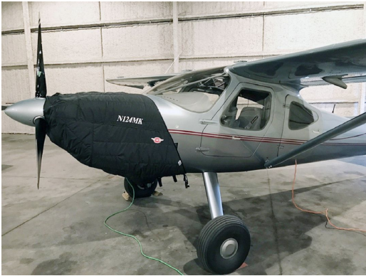
OMF Symphony Canopy, Wings, Horiz. Stab, and Prop Covers Glasair Aviation Glastar, Sportsman 2+2 Insulated Engine Cover