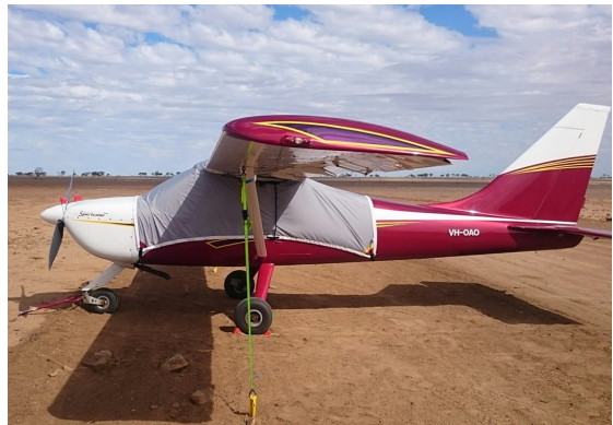
Glastar Sportsman Light Weight Travel Cover

Travel Covers are made with Silver Solution-Dyed Polyester fabric and only lined over the windshield to save weight. The material is lightweight and more compact for easy stowage in the aircraft. The polyester material is water resistant, but only intended for occasional use outside. We also have an ultra lightweight material available for fitted hangar dust covers. For daily outdoor use, the non-travel Sunbrella Cover is the best choice.