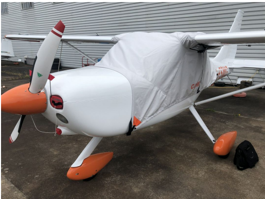
Glastar Canopy Cover, Engine Plugs