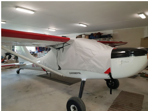
Glasair Sportsman Over-Top Canopy Cover

This cover type is made from Silver Acrylic Sunbrella canvas and is 100% lined with a soft and smooth microfiber. Bruce's Custom Covers developed this material combination especially for aircraft protection. The outer material is medium weight and treated for water resistance, UV resistance and anti-static buildup. The inner lining is a very soft and smooth microfiber to prevent scratching. The material is very reflective, and tests show that the cabin interior temperature can be reduced to near-ambient temperature on the hottest of days. It is water, ice and snow repellent, yet breathable to allow moisture to escape from between the cover and the aircraft surface.