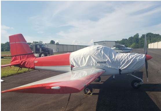
Van's RV-12 Canopy/Engine Cover, Tailcone Cover (raincap type)

This cover type is made from Silver Acrylic Sunbrella canvas and is 100% lined with a soft and smooth microfiber. Bruce's Custom Covers developed this material combination especially for aircraft protection. The outer material is medium weight and treated for water resistance, UV resistance and anti-static buildup. The inner lining is a very soft and smooth microfiber to prevent scratching. The material is very reflective, and tests show that the cabin interior temperature can be reduced to near-ambient temperature on the hottest of days. It is water, ice and snow repellent, yet breathable to allow moisture to escape from between the cover and the aircraft surface.