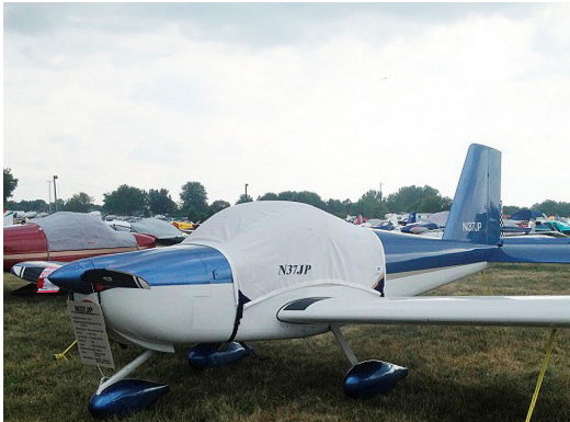
Vans's RV-12 Canopy Cover