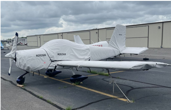
Vans RV-12 Complete Cover Set