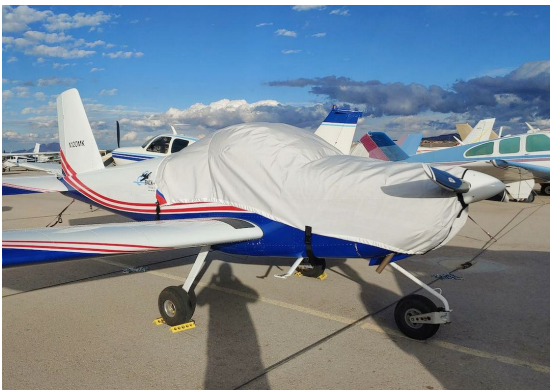
Vans RV-12 Canopy/Engine Cover

Travel Covers are made with Silver Solution-Dyed Polyester fabric and only lined over the windshield to save weight. The material is lightweight and more compact for easy stowage in the aircraft. The polyester material is water resistant, but only intended for occasional use outside. We also have an ultra lightweight material available for fitted hangar dust covers. For daily outdoor use, the non-travel Sunbrella Cover is the best choice.