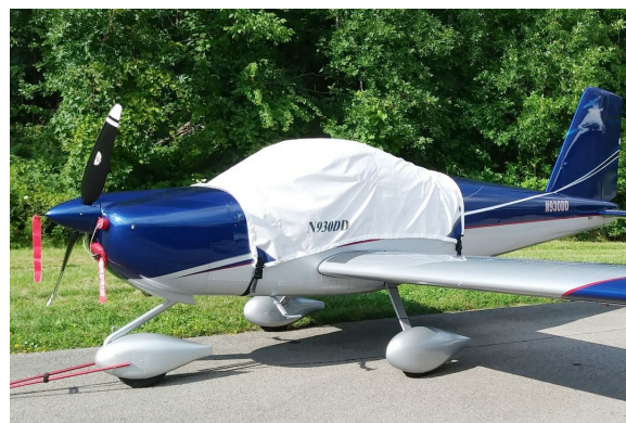
Van's Aircraft RV-12 Canopy Cover