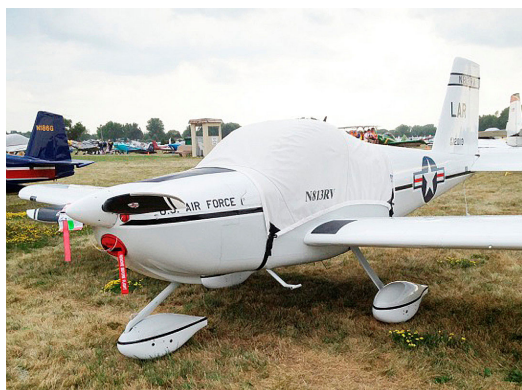
Van's RV-12 Canopy Cover & Engine Plugs

Engine Inlet Plugs are custom fit for your Van's Aircraft RV-12 & RV-12is intakes, made with heavy-duty vinyl material, and stuffed with a single block of sculpted urethane foam. Each plug has a zipper that allows the foam to be removed and dried if necessary. Engine plugs have warning flags that are visible from the cockpit or 'remove before flight' streamers sewn onto the face of the plugs. Most plugs are imprinted with the aircraft registration number in black for an extra charge. Storage bag NOT included. Engine plugs may be inserted after flight when the engine is still warm. Engine Inlet Plugs are commonly referred to as Cowl Plugs, Intake Plugs, Cowl Blocks, Engine Blocks, and Engine Bunges.