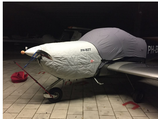
RV-12 Travel Cover, Light Weight Canopy Cover, w/18" forward extension