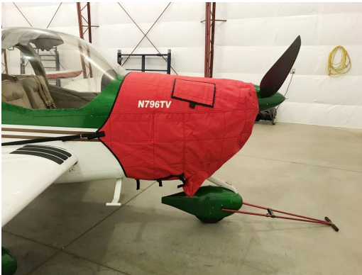
Van's RV-12 Insulated Engine Cover

This cover type is made from Silver Acrylic Sunbrella canvas and is 100% lined with a soft and smooth microfiber. Bruce's Custom Covers developed this material combination especially for aircraft protection. The outer material is medium weight and treated for water resistance, UV resistance and anti-static buildup. The inner lining is a very soft and smooth microfiber to prevent scratching. The material is very reflective, and tests show that the cabin interior temperature can be reduced to near-ambient temperature on the hottest of days. It is water, ice and snow repellent, yet breathable to allow moisture to escape from between the cover and the aircraft surface.