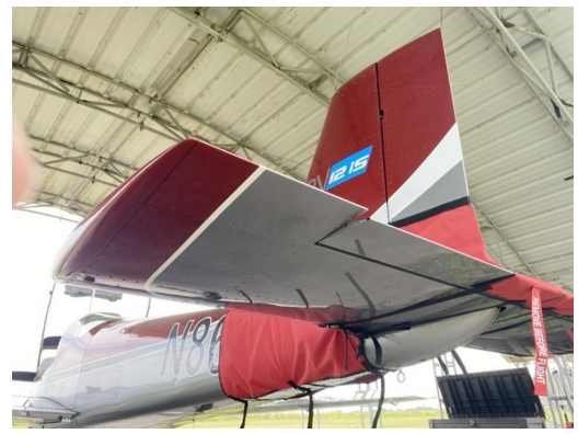
Van's RV-12 Tailcone Cover, raincap type