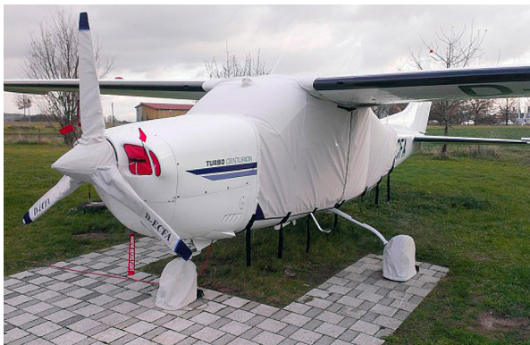
Cessna 210 Extended Canopy Cover, Engine Plugs, Prop and Tire Covers

ALL-YEAR USE MATERIAL - Made with Silver Acrylic Sunbrella canvas, the all-year use material is the best option for sun protection and cover longevity. This heavier more durable material is intended for all weather conditions, such as rain and snow or lots of sun.