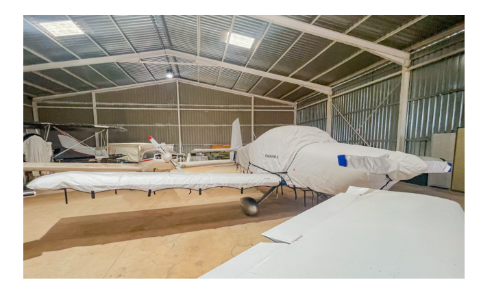
Van's RV-10 Full Cover Set