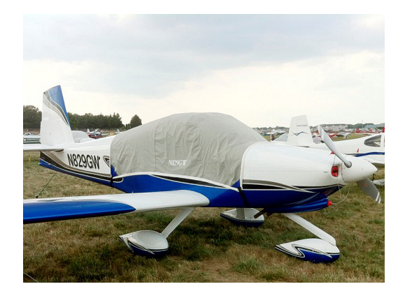
Van's RV-10 Canopy Cover & Engine Inlet Plugs

This cover type is made from Silver Acrylic Sunbrella canvas and is 100% lined with a soft and smooth microfiber. Bruce's Custom Covers developed this material combination especially for aircraft protection. The outer material is medium weight and treated for water resistance, UV resistance and anti-static buildup. The inner lining is a very soft and smooth microfiber to prevent scratching. The material is very reflective, and tests show that the cabin interior temperature can be reduced to near-ambient temperature on the hottest of days. It is water, ice and snow repellent, yet breathable to allow moisture to escape from between the cover and the aircraft surface.