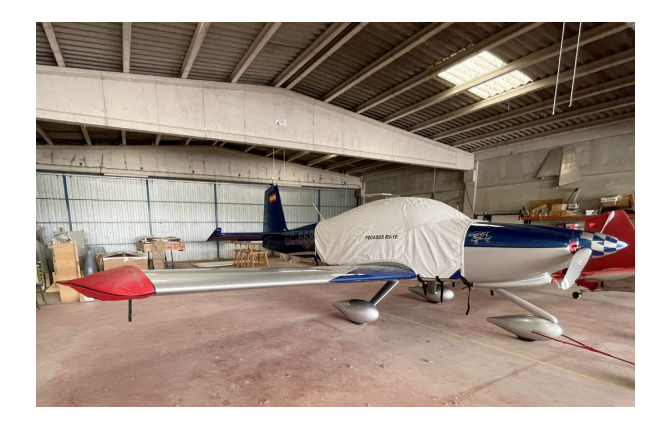
Van's RV-10 Extended Canopy Cover, Wingtip Pads