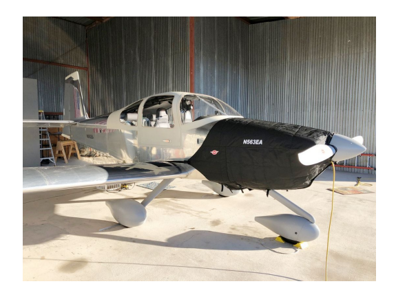
Van's RV-10 Fully Enclosed Insulated Engine Cover