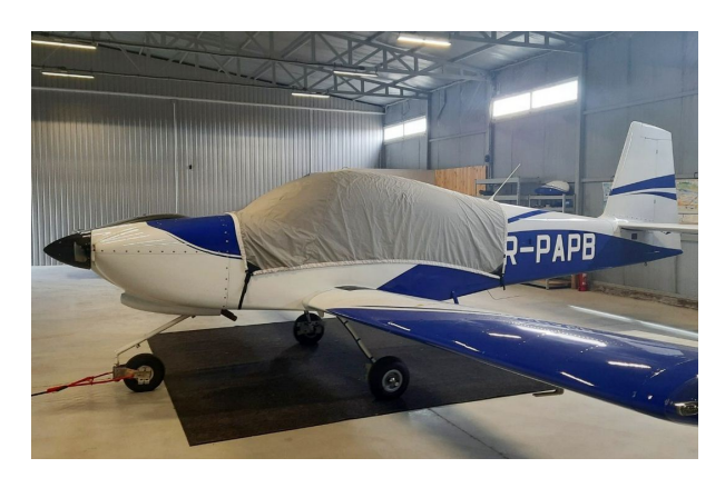
Van's RV-10 Travel Weight Canopy Cover