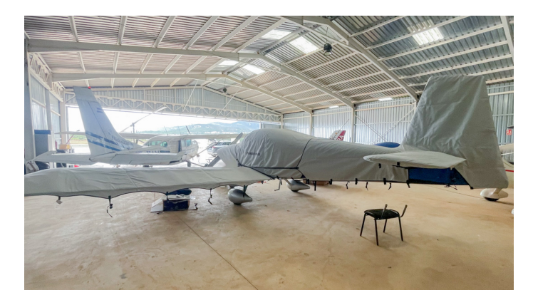
Van's RV-10 Full Cover Set

This cover type is made from Silver Acrylic Sunbrella canvas and is 100% lined with a soft and smooth microfiber. Bruce's Custom Covers developed this material combination especially for aircraft protection. The outer material is medium weight and treated for water resistance, UV resistance and anti-static buildup. The inner lining is a very soft and smooth microfiber to prevent scratching. The material is very reflective, and tests show that the cabin interior temperature can be reduced to near-ambient temperature on the hottest of days. It is water, ice and snow repellent, yet breathable to allow moisture to escape from between the cover and the aircraft surface.