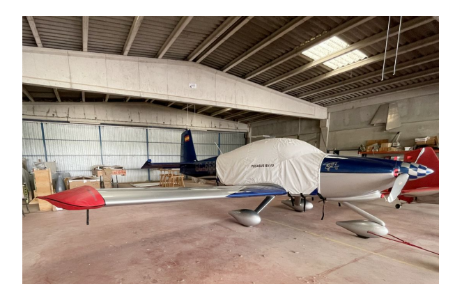
Van's RV-10 Extended Canopy Cover, Wingtip Pads

Designed to prevent damage to the aircraft extremities in crowded hangars, these products are made of bright red Naugahyde and thickly padded with a sandwich of closed cell foam.