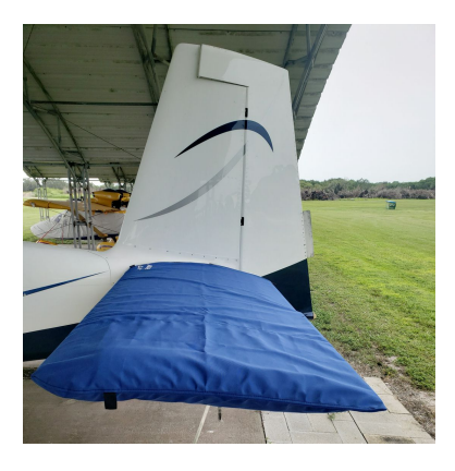
Van's RV-10 Horizontal Stabilizer Covers