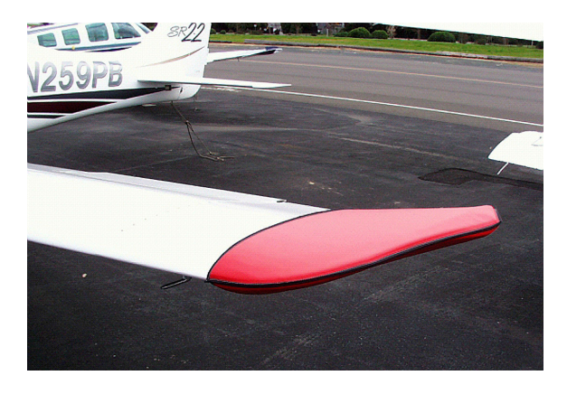
Cirrus SR-22 Wingtip Pad (also available for the Horiz. Stab.