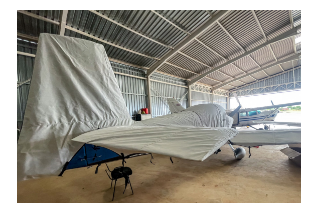
Van's RV-10 Full Cover Set