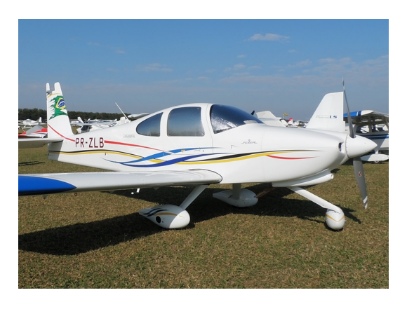
Van's RV-10 HeatShield Set