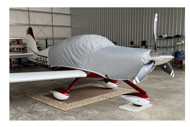
Van's RV-10 Travel Cover

Travel Covers are made with Silver Solution-Dyed Polyester fabric and only lined over the windshield to save weight. The material is lightweight and more compact for easy stowage in the aircraft. The polyester material is water resistant, but only intended for occasional use outside. We also have an ultra lightweight material available for fitted hangar dust covers. For daily outdoor use, the non-travel Sunbrella Cover is the best choice.