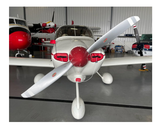
Van's RV-10 Engine Inlet Plugs

Engine Inlet Plugs are custom fit for your Van's Aircraft RV-10 intakes, made with heavy-duty vinyl material, and stuffed with a single block of sculpted urethane foam. Each plug has a zipper that allows the foam to be removed and dried if necessary. Engine plugs have warning flags that are visible from the cockpit or 'remove before flight' streamers sewn onto the face of the plugs. Most plugs are imprinted with the aircraft registration number in black for an extra charge. Storage bag NOT included. Engine plugs may be inserted after flight when the engine is still warm. Engine Inlet Plugs are commonly referred to as Cowl Plugs, Intake Plugs, Cowl Blocks, Engine Blocks, and Engine Bungs.