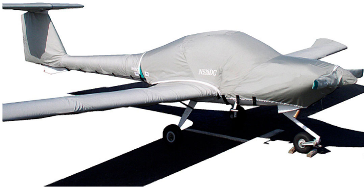
DA-20 Full Cover Set