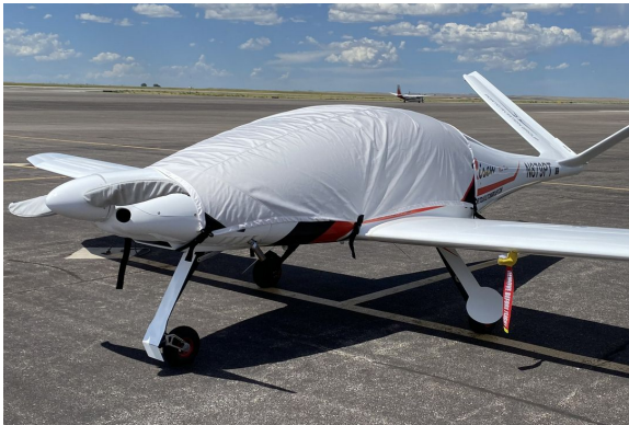
Swiss Excellence Risen 914 Canopy Cover

This cover type is made from Silver Acrylic Sunbrella canvas and is 100% lined with a soft and smooth microfiber. Bruce's Custom Covers developed this material combination especially for aircraft protection. The outer material is medium weight and treated for water resistance, UV resistance and anti-static buildup. The inner lining is a very soft and smooth microfiber to prevent scratching. The material is very reflective, and tests show that the cabin interior temperature can be reduced to near-ambient temperature on the hottest of days. It is water, ice and snow repellent, yet breathable to allow moisture to escape from between the cover and the aircraft surface.