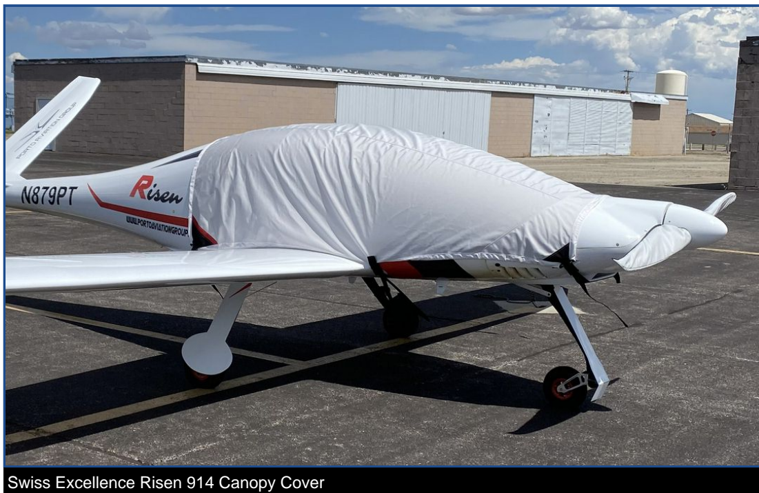
Swiss Excellence Risen 914 Canopy Cover