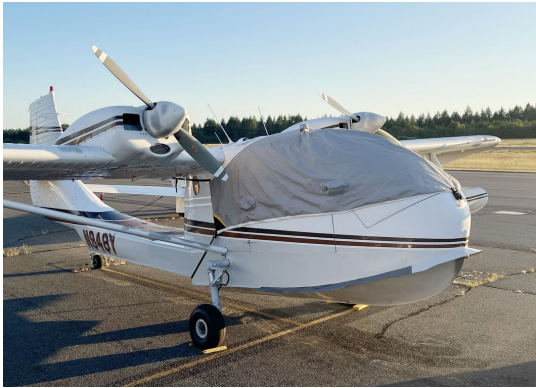
Twin Bee Canopy Cover