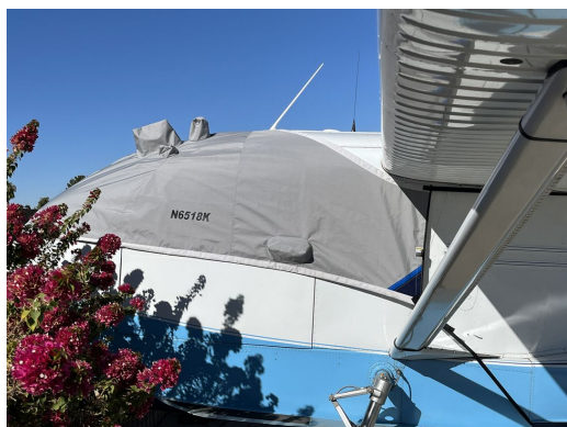
Seabee Amphibian Travel Cover, Light Weight Canopy Cover

This cover type is made from Silver Acrylic Sunbrella canvas and is 100% lined with a soft and smooth microfiber. Bruce's Custom Covers developed this material combination especially for aircraft protection. The outer material is medium weight and treated for water resistance, UV resistance and anti-static buildup. The inner lining is a very soft and smooth microfiber to prevent scratching. The material is very reflective, and tests show that the cabin interior temperature can be reduced to near-ambient temperature on the hottest of days. It is water, ice and snow repellent, yet breathable to allow moisture to escape from between the cover and the aircraft surface.