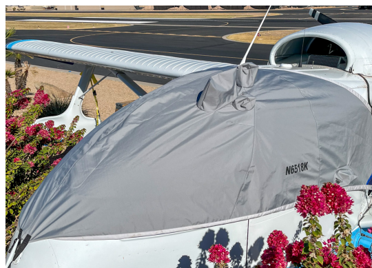
Seabee Amphibian Travel Cover, Light Weight Canopy Cover