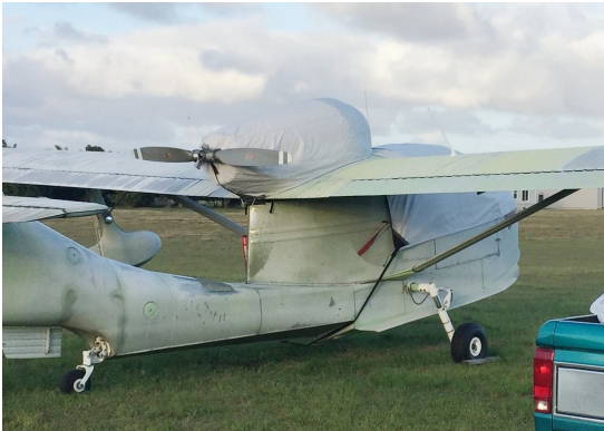
Republic Seabee Amphibian Engine Cover

water resistance, UV resistance and anti-static buildup. The inner lining is a very soft and smooth microfiber to prevent scratching. The material is very reflective, and tests show that the cabin interior temperature can be reduced to near-ambient temperature on the hottest of days. It is water, ice and snow repellent, yet breathable to allow moisture to escape from between the cover and the aircraft surface.