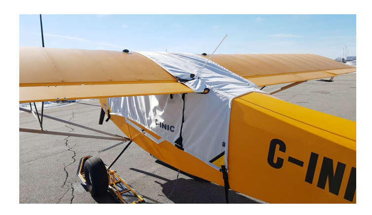
Rans S7-S Canopy Cover Over-The-Top-Style