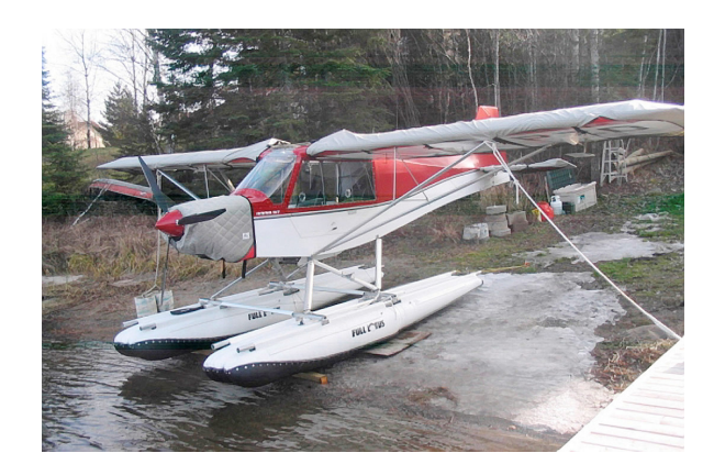
FOR INTERIOR USE. Cub Crafters CC-11 Insulated Hangar Blanket, Rans S-7 Insulated Engine, Wing and Horizontal Stabilizer available in Red or Silver Covers