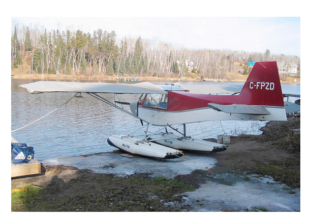
Rans S-7 Insulated Engine Cover, Wing Covers and Horizontal Stabilizer Covers