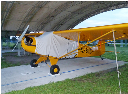
Piper J-3 Extended Canopy Cover