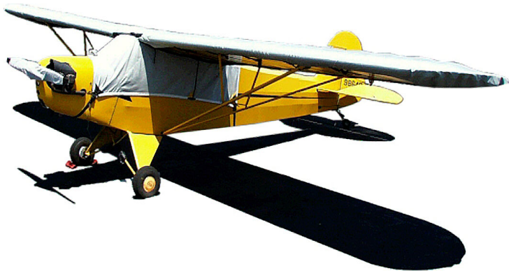
Piper J3 Canopy, Wing and Prop Covers

This cover type is made from Silver Acrylic Sunbrella canvas and is 100% lined with a soft and smooth microfiber. Bruce's Custom Covers developed this material combination especially for aircraft protection. The outer material is medium weight and treated for water resistance, UV resistance and anti-static buildup. The inner lining is a very soft and smooth microfiber to prevent scratching. The material is very reflective, and tests show that the cabin interior temperature can be reduced to near-ambient temperature on the hottest of days. It is water, ice and snow repellent, yet breathable to allow moisture to escape from between the cover and the aircraft surface.