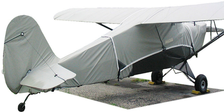
Taylorcraft L-2 Grasshopper Prop, Engine, Canopy, Wing and Empennage Covers