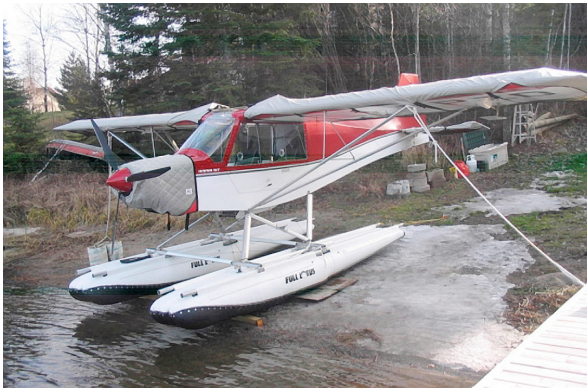
Rans S-7 Insulated Engine, Wing and Horizontal Stabilizer Covers FOR INTERIOR USE. Cub Crafters CC-11 Insulated Hangar Blanket, available in Red or Silver

This cover type is made from Silver Acrylic Sunbrella canvas and is 100% lined with a soft and smooth microfiber. Bruce's Custom Covers developed this material combination especially for aircraft protection. The outer material is medium weight and treated for water resistance, UV resistance and anti-static buildup. The inner lining is a very soft and smooth microfiber to prevent scratching. The material is very reflective, and tests show that the cabin interior temperature can be reduced to near-ambient temperature on the hottest of days. It is water, ice and snow repellent, yet breathable to allow moisture to escape from between the cover and the aircraft surface.