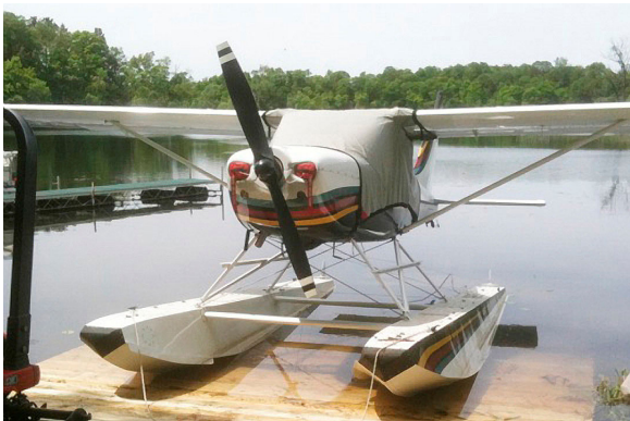
Glastar Sportsman Canopy Cover and Engine Plugs

Engine Inlet Plugs are custom fit for your Rans S-21 Outbound intakes, made with heavy-duty vinyl material, and stuffed with a single block of sculpted urethane foam. Each plug has a zipper that allows the foam to be removed and dried if necessary. Engine plugs have warning flags that are visible from the cockpit or 'remove before flight' streamers sewn onto the face of the plugs. Most plugs are imprinted with the aircraft registration number in black for an extra charge. Storage bag NOT included. Engine plugs may be inserted after flight when the engine is still warm. Engine Inlet Plugs are commonly referred to as Cowl Plugs, Intake Plugs, Cowl Blocks, Engine Blocks, and Engine Bung.