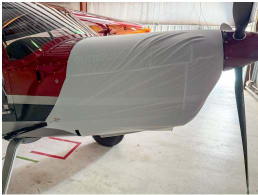
Rans S-21 Engine Cover, test fit cover

the hottest of days. It is water, ice and snow repellent, yet breathable to allow moisture to escape from between the cover and the aircraft surface.