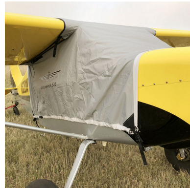
Rans S-20 Raven Travel Cover, Light Weight Travel Canopy Cover