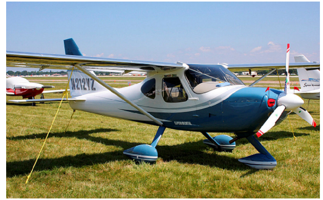
Glastar Sportsman Engine Inlet Plugs