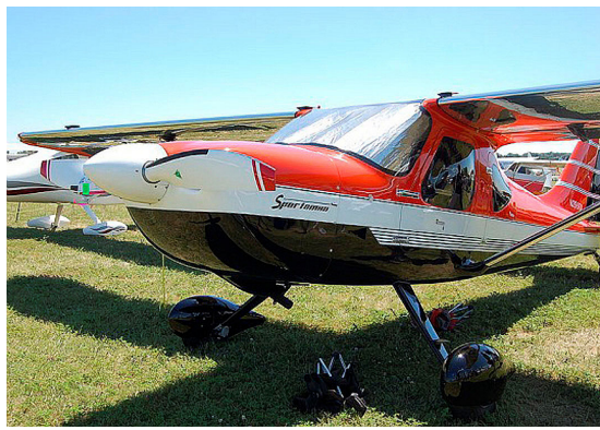
Glasstar Sportsman Windshield HeatShield