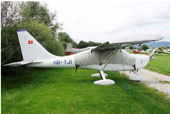
Glaster Canopy, Wings, Horizontal Stab. & Prop Covers

WINTER USE MATERIAL - Made with Solution-Dyed Polyester fabric, this option is intended for seasonal use to aid in deicing, rain mitigation, or for occasional travel. The material is lighter and more compact, but more susceptible to UV damage and may have a shorter useful life if used continuously outside than the all-year use material.