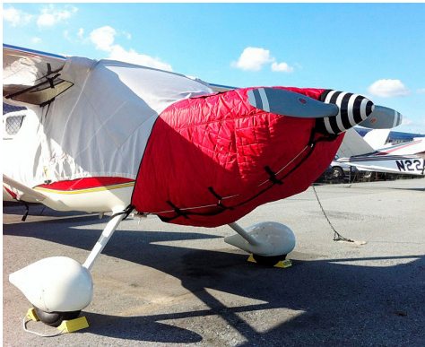
Glastar Insulated Engine Cover