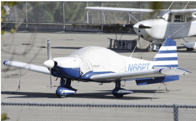
Robin R-2160 Canopy Cover with 12" forward Extension