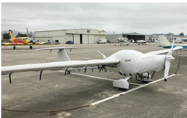
Distar Sundancer LSA Extended Canopy/Engine, Prop, Wheel pants, Wings & Empennage Covers