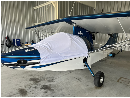
SeaRey Cockpit ONLY Cover, test fit cover