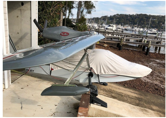
Searey Canopy/Nose Cover