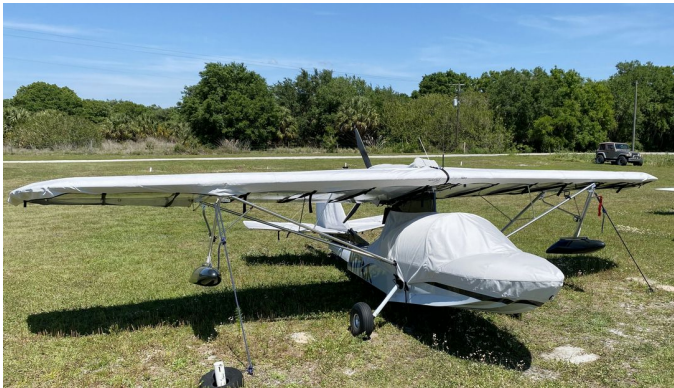
Searey Complete Cover Set