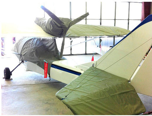
SeaRey Canopy, Engine, Wing & Horizontal Stab. (test fit covers)