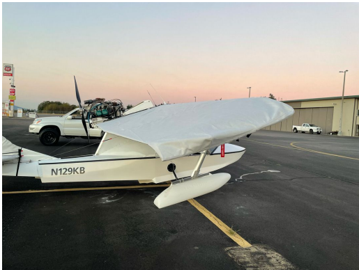
SeaRey Wing Covers

Although these covers are bulky, they do help protect your wing and control surfaces against small to medium-size hail. ALL-YEAR USE MATERIAL - Made with Silver Acrylic Sunbrella canvas, the all-year use material is the best option for sun protection and cover longevity. This heavier more durable material is intended for all weather conditions, such as rain and snow or lots of sun. WINTER USE MATERIAL - Made with Solution-Dyed Polyester fabric, this option is intended for seasonal use to aid in deicing, rain mitigation, or for occasional travel. The material is lighter and more compact, but more susceptible to UV damage and may have a shorter useful life if used continuously outside than the all-year use material.