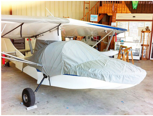
SeaRey Canopy Cover (test fit cover)