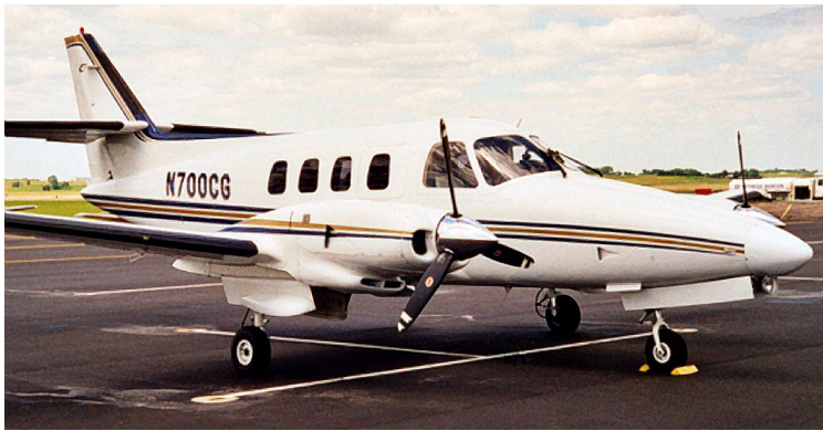
Covers & Plugs for the Aero Commander 700