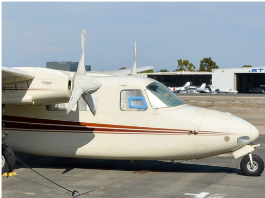
Aero Commander AC500 Ptopellor/Spinner Covers

This cover type is made from Silver Acrylic Sunbrella canvas and is 100% lined with a soft and smooth microfiber. Bruce's Custom Covers developed this material combination especially for aircraft protection. The outer material is medium weight and treated for water resistance, UV resistance and anti-static buildup. The inner lining is a very soft and smooth microfiber to prevent scratching. The material is very reflective, and tests show that the cabin interior temperature can be reduced to near-ambient temperature on the hottest of days. It is water, ice and snow repellent, yet breathable to allow moisture to escape from between the cover and the aircraft surface.