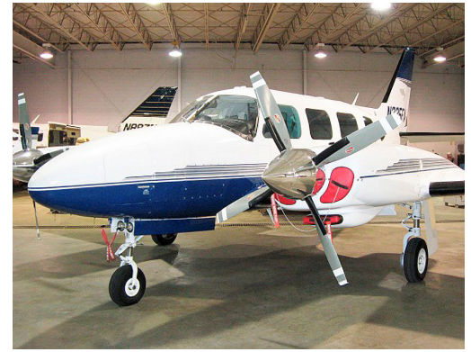
Piper Navajo PA31 Engine Inlet Plugs (Panther Conversion)