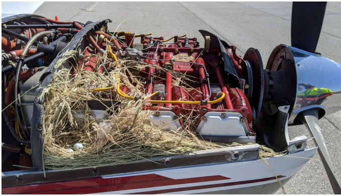
ENGINE PLUGS PREVENT BIRD NEST FOD. Piper Saratoga Engine Cowling Bird's Nest