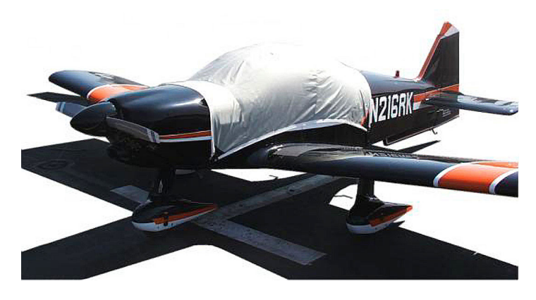
Robin R.2160 Canopy Cover