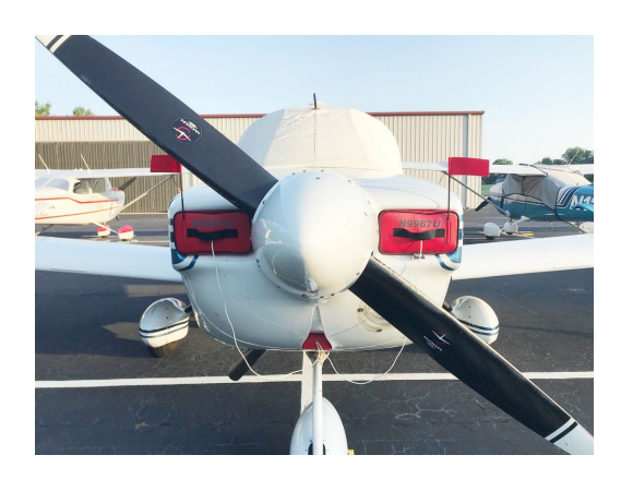
Grumman AA-5A Engine Inlet Plugs, Traveler models w/carb inlet plug (set of 3) on a

Engine Inlet Plugs are custom fit for your Robin 3140 & R-3000 intakes, made with heavy-duty vinyl material, and stuffed with a single block of sculpted urethane foam. Each plug has a zipper that allows the foam to be removed and dried if necessary. Engine plugs have warning flags that are visible from the cockpit or 'remove before flight' streamers sewn onto the face of the plugs. Most plugs are imprinted with the aircraft registration number in black for an extra charge. Storage bag NOT included. Engine plugs may be inserted after flight when the engine is still warm. Engine Inlet Plugs are commonly referred to as Cowl Plugs, Intake Plugs, Cowl Blocks, Engine Blocks, and Engine Bungs.