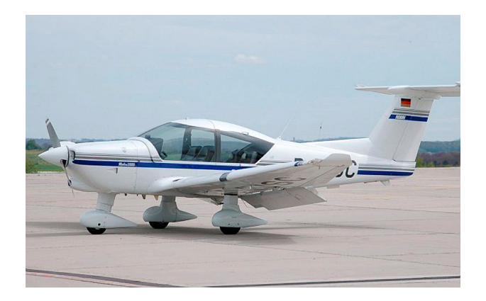
Canopy Cover for the Robin 3140 & R-3000