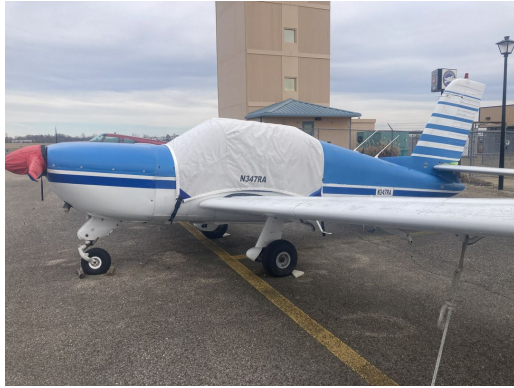
SOCATA Rallye 150 Canopy Cover, Prop Cover

The Aerospatiale (Socata) Rallye 150 Canopy/Engine Cover is a one-piece cover (100% lined with microfiber) that is a combination of the Canopy Cover and Engine Cover. This cover will enclose the engine cowl and will extend aft to cover all of the windows. This cover type is made from Silver Acrylic Sunbrella canvas and is 100% lined with a soft and smooth microfiber. Bruce's Custom Covers developed this material combination especially for aircraft protection. The outer material is medium weight and treated for water resistance, UV resistance and anti-static buildup. The inner lining is a very soft and smooth microfiber to prevent scratching. The material is very reflective, and tests show that the cabin interior temperature can be reduced to near-ambient temperature on the hottest of days. It is water, ice and snow repellent, yet breathable to allow moisture to escape from between the cover and the aircraft surface.