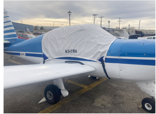
SOCATA Rallye 150 Canopy Cover