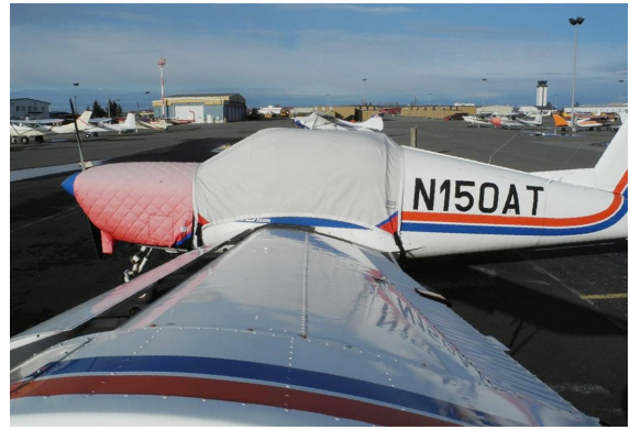
Kolibier 150A Canopy Cover, Insulated Engine Cover