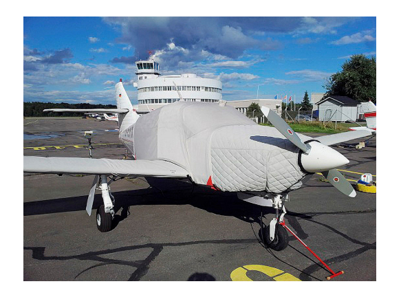
Rockwell Commander 114A Canopy, Engine, Wings & Horizontal Rockwell Commander 114 Extended Canopy, Insulated Engine, Stab. Covers Wing Covers