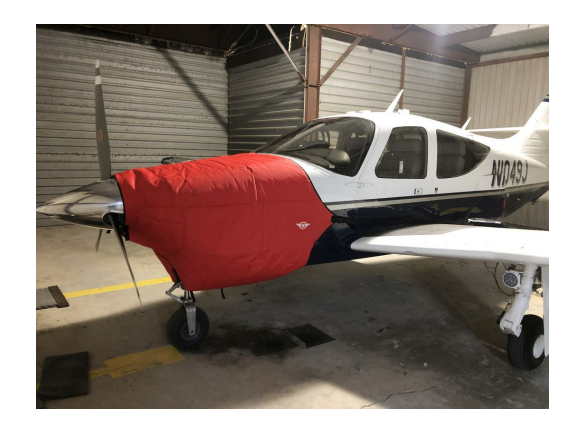
Aero Commander 112 Insulated engine cover

This cover type is made from Silver Acrylic Sunbrella canvas and is 100% lined with a soft and smooth microfiber. Bruce's Custom Covers developed this material combination especially for aircraft protection. The outer material is medium weight and treated for water resistance, UV resistance and anti-static buildup. The inner lining is a very soft and smooth microfiber to prevent scratching. The material is very reflective, and tests show that the cabin interior temperature can be reduced to near-ambient temperature on the hottest of days. It is water, ice and snow repellent, yet breathable to allow moisture to escape from between the cover and the aircraft surface.