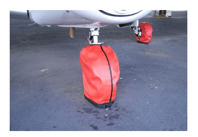
Piper PA28-140 Tire Covers

ALL-YEAR USE MATERIAL - Made with Silver Acrylic Sunbrella canvas, the all-year use material is the best option for sun protection and cover longevity. This heavier more durable material is intended for all weather conditions, such as rain and snow or lots of sun.