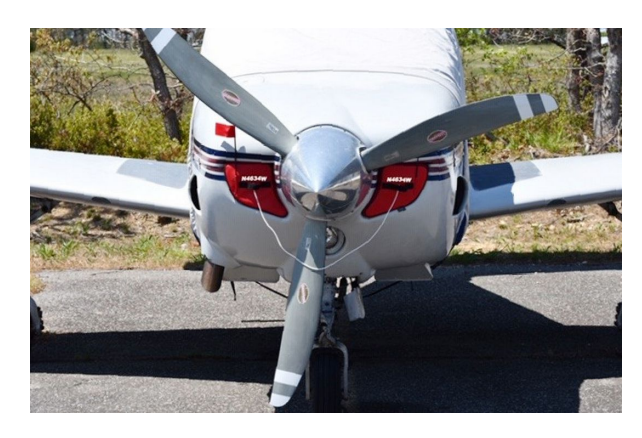
Rockwell 114 Engine Plugs