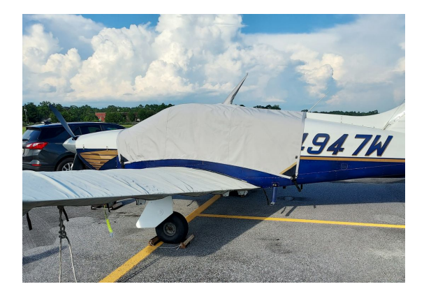
Rockwell 114 Canopy Cover & Wing Covers