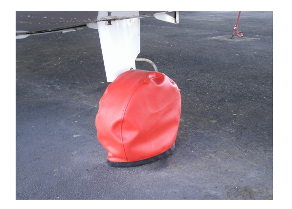
Piper PA28-140 Tire Covers