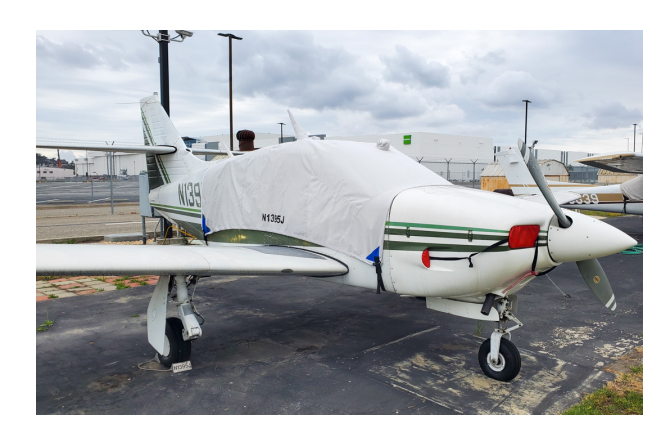
Rockwell International 112A Canopy Cover

This cover type is made from Silver Acrylic Sunbrella canvas and is 100% lined with a soft and smooth microfiber. Bruce's Custom Covers developed this material combination especially for aircraft protection. The outer material is medium weight and treated for water resistance, UV resistance and anti-static buildup. The inner lining is a very soft and smooth microfiber to prevent scratching. The material is very reflective, and tests show that the cabin interior temperature can be reduced to near-ambient temperature on the hottest of days. It is water, ice and snow repellent, yet breathable to allow moisture to escape from between the cover and the aircraft surface.