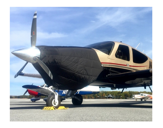
Rockwell Aero Commander Insulated Engine Cover