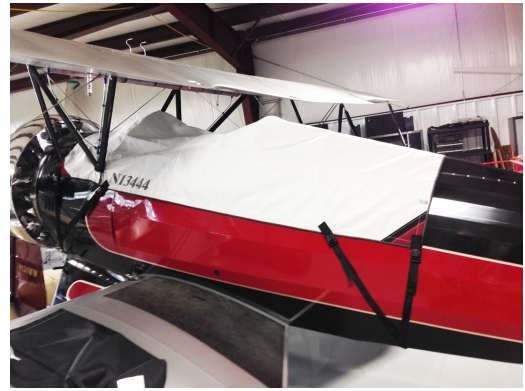
Waco QCF/UBF Canopy Cover