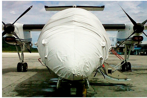
De Havilland Dash 8 Cockpit/Nose Cover