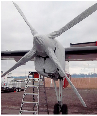
Dash 8 Insulated Engine & Prop Covers