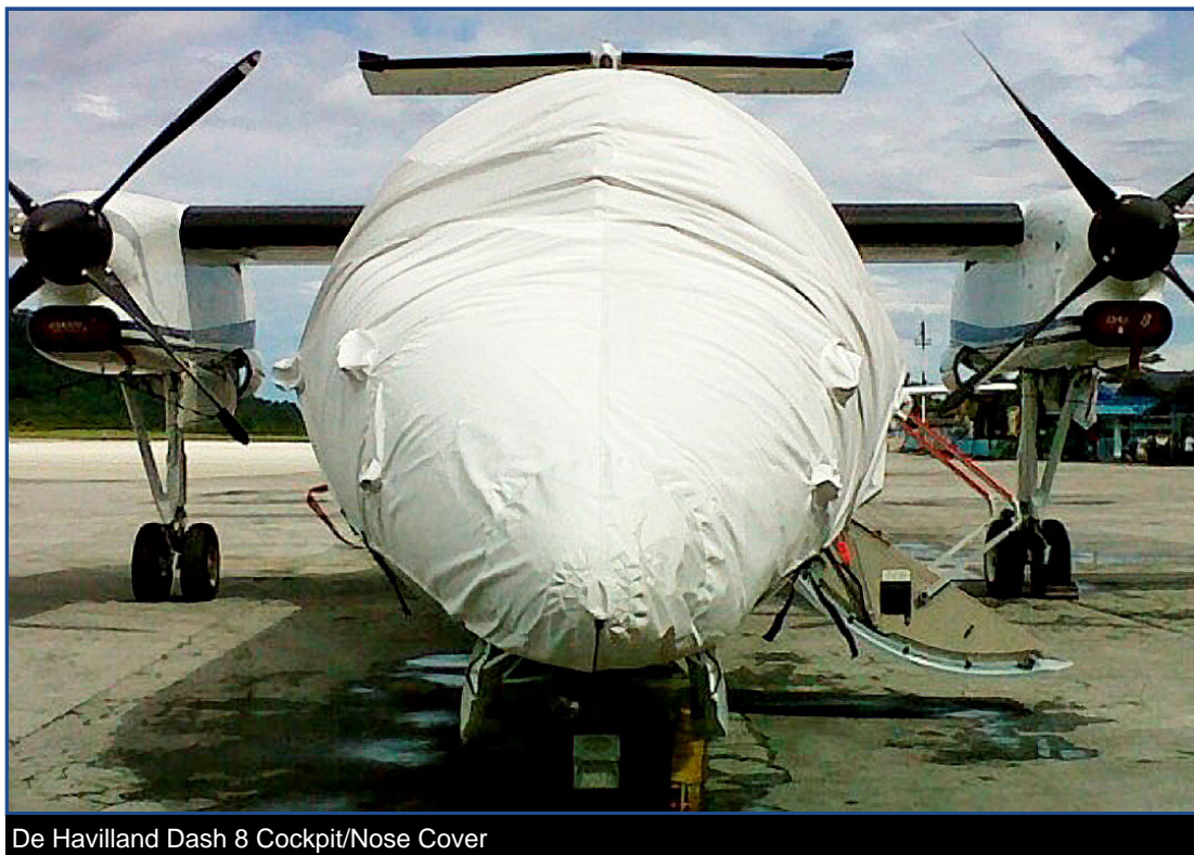
De Havilland Dash 8 Cockpit/Nose Cover