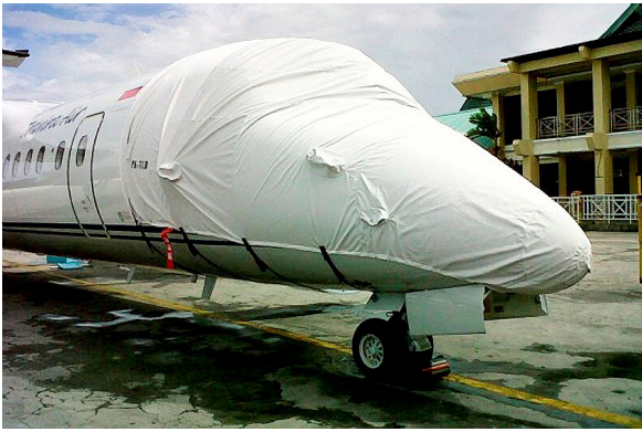
De Havilland Dash 8 Cockpit/Nose Cover