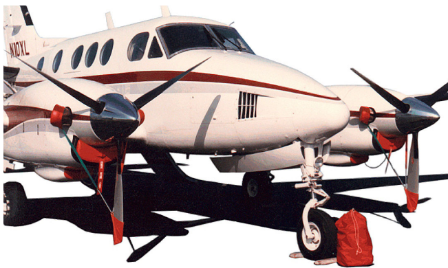
Pitot, Exhaust Covers, Engine Plugs & Prop Ties