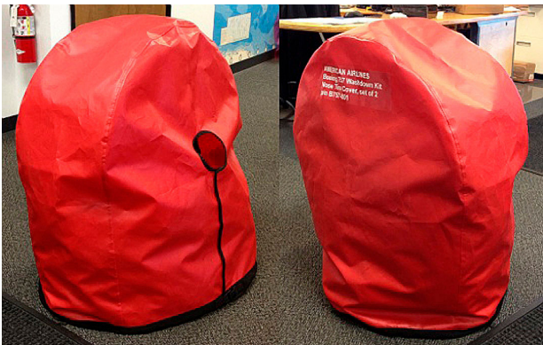
Boeing 757 Tire Covers, great for Wash Prep or Storage

ALL-YEAR USE MATERIAL - Made with Silver Acrylic Sunbrella canvas, the all-year use material is the best option for sun protection and cover longevity. This heavier more durable material is intended for all weather conditions, such as rain and snow or lots of sun.