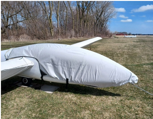
Wsk Pzl-Krosno KR-03A Canopy/Nose Cover