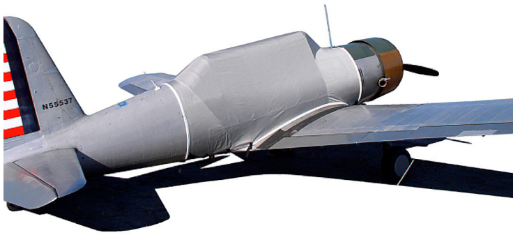
BT-13 Extended Canopy Cover