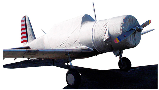
BT-13 Extended Canopy & Engine Covers