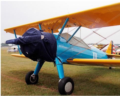
Stearman Canopy, Engine & Prop Covers