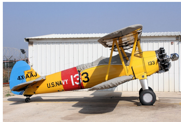
Boeing Stearman PT-13 Canopy, Wing & Horiz. Stab Covers