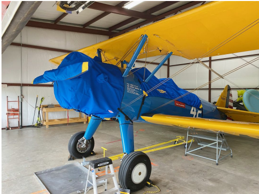
Boeing Stearman PT-13 Canopy, Engine & Prop Covers