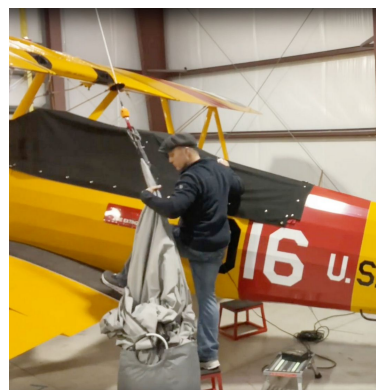
#2: Attach to electric hoist.