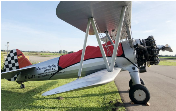
Boeing Stearman PT-13 Canopy Cover

the hottest of days. It is water, ice and snow repellent, yet breathable to allow moisture to escape from between the cover and the aircraft surface.