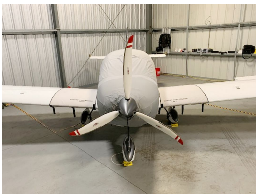
Czech Sport Travel Light Weight Canopy/Engine Cover, Wing Locker Covers