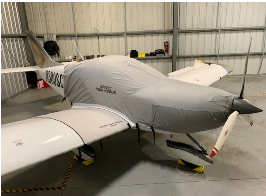
Czech Sport Travel Light Weight Canopy/Engine Cover, Wing Locker Covers