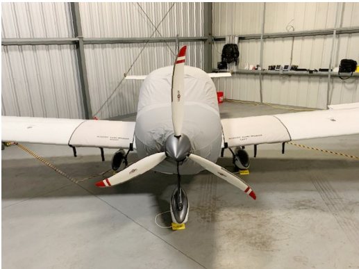
Czech Sport Travel Light Weight Canopy/Engine Cover, Wing Locker Covers

Travel Covers are made with Silver Solution-Dyed Polyester fabric and only lined over the windshield to save weight. The material is lightweight and more compact for easy stowage in the aircraft. The polyester material is water resistant, but only intended for occasional use outside. We also have an ultra lightweight material available for fitted hangar dust covers. For daily outdoor use, the non-travel Sunbrella Cover is the best choice.