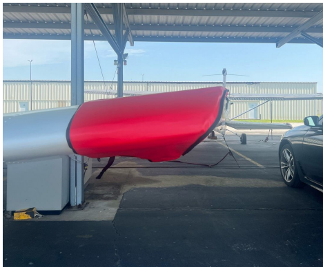
Piper PA-28-140 Wingtip Pads

Designed to prevent damage to the aircraft extremities in crowded hangars, these products are made of bright red Naugahyde and thickly padded with a sandwich of closed cell foam.