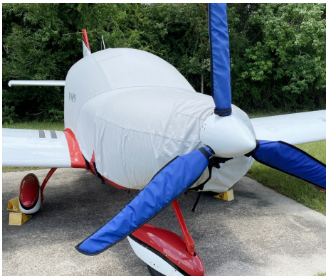
PiperSport Extended Canopy/Engine Cover

This cover type is made from Silver Acrylic Sunbrella canvas and is 100% lined with a soft and smooth microfiber. Bruce's Custom Covers developed this material combination especially for aircraft protection. The outer material is medium weight and treated for water resistance, UV resistance and anti-static buildup. The inner lining is a very soft and smooth microfiber to prevent scratching. The material is very reflective, and tests show that the cabin interior temperature can be reduced to near-ambient temperature on the hottest of days. It is water, ice and snow repellent, yet breathable to allow moisture to escape from between the cover and the aircraft surface.