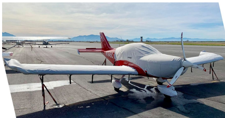
Czech Sport Canopy/Engine & Wing Covers

WINTER USE MATERIAL - Made with Solution-Dyed Polyester fabric, this option is intended for seasonal use to aid in deicing, rain mitigation, or for occasional travel. The material is lighter and more compact, but more susceptible to UV damage and may have a shorter useful life if used continuously outside than the all-year use material.