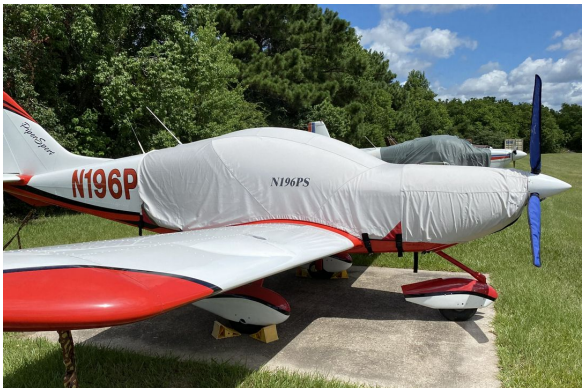
Piper Sport Extended Canopy/Engine Cover