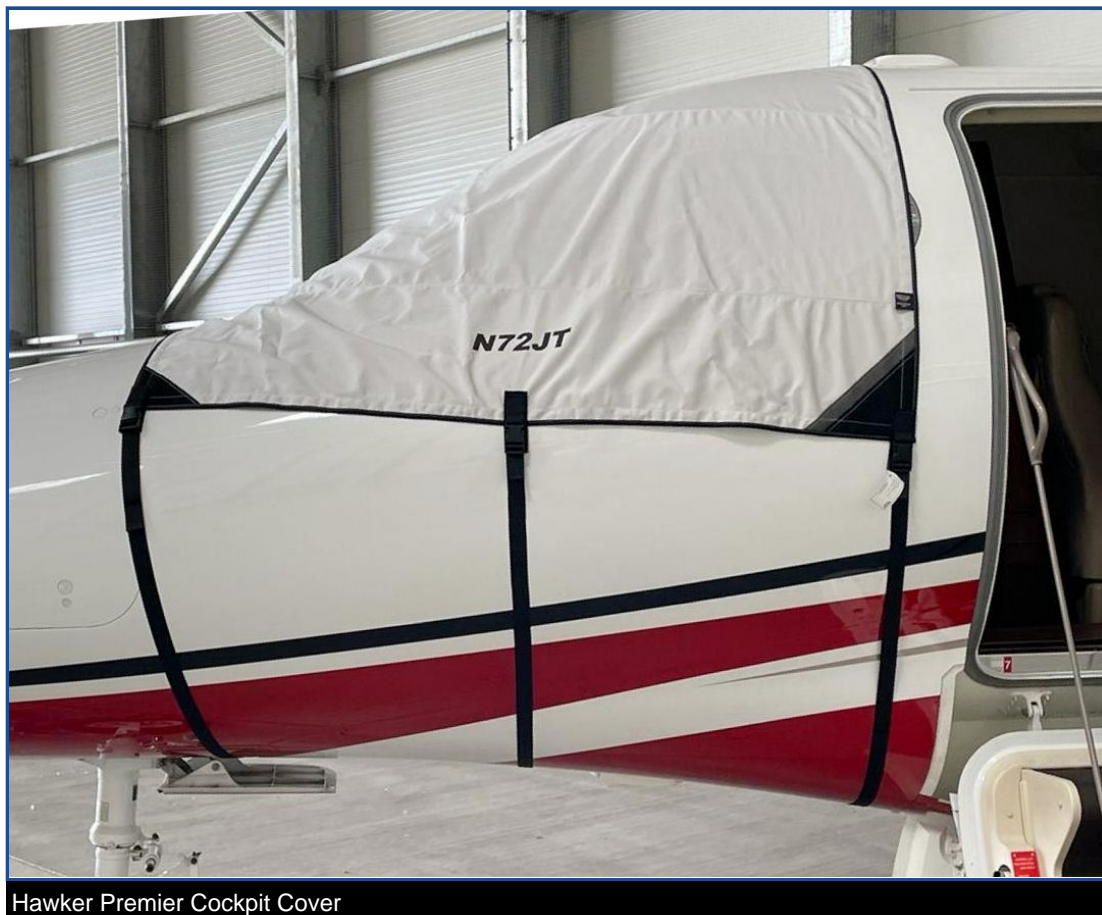
Hawker Premier Cockpit Cover