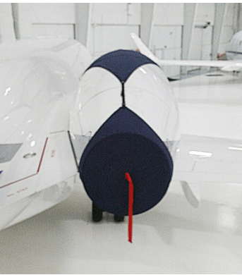
Challenger 300 Intake/Exhaust Cover Set, 3-strap type