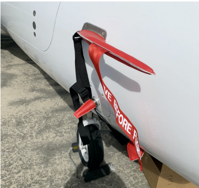
Beech Premier Pitot, AOA, Rosemont Cover Set