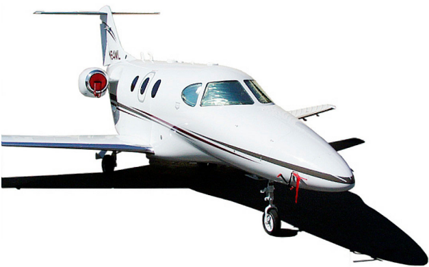
Raytheon Premier Intake Plugs, Pitot Covers & Cockpit HeatShields