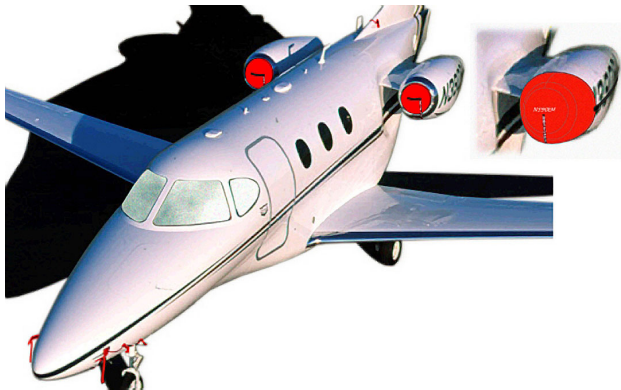
Premier Intake Plugs, Intake Covers, Pitot Covers & Cockpit HeatShields