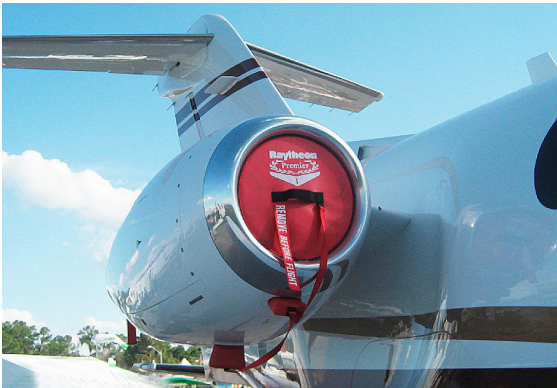
Premier Intake/Exhaust Plug set with Generator Inlet/Exhaust Plugs

The Hawker Beechcraft Premier 390 Intake/Exhaust Plugs are custom fit for the intake and exhaust openings, made with heavy-duty vinyl material, and stuffed with a single block of sculpted urethane foam. Each plug has a zipper that allows the foam to be removed and dried if necessary. Engine plugs have 'remove before flight' streamers sewn onto the face of the plugs. Most plugs are imprinted with the aircraft registration number in black. Engine plugs may be inserted after flight when the engine is still warm. Engine Inlet Plugs are commonly referred to as Cowl Plugs, Intake Plugs, Cowl Blocks, Engine Blocks, and Engine Bungs.