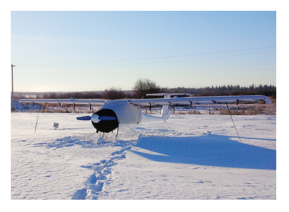
Pipistrel Canopy, Wings, Tail & Insulated Engine Covers