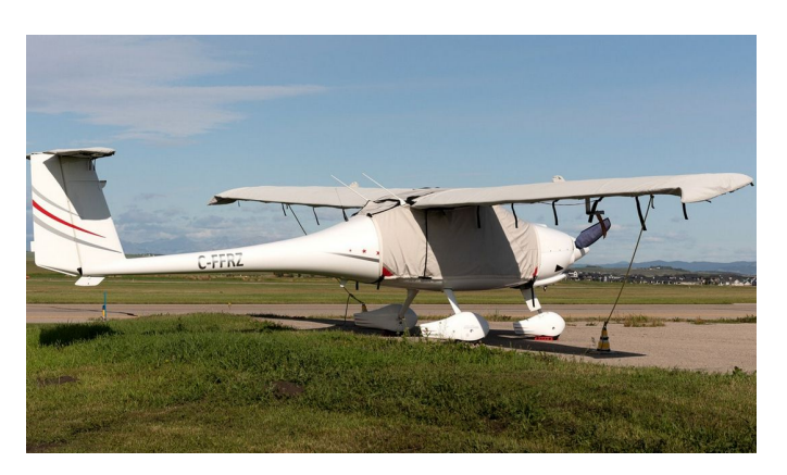
Pipistrel Virus SW Canopy & Wing Covers