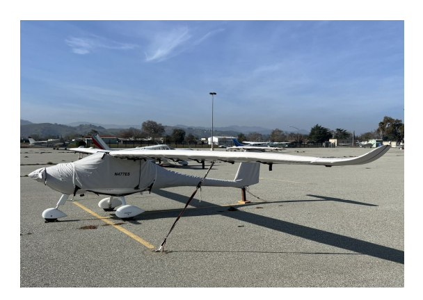
Pipistrel Sinus LSA Full Cover Set

WINTER USE MATERIAL - Made with Solution-Dyed Polyester fabric, this option is intended for seasonal use to aid in deicing, rain mitigation, or for occasional travel. The material is lighter and more compact, but more susceptible to UV damage and may have a shorter useful life if used continuously outside than the all-year use material.