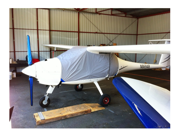
Pipistrel Light Weight Travel Canopy Cover

Travel Covers are made with Silver Solution-Dyed Polyester fabric and only lined over the windshield to save weight. The material is lightweight and more compact for easy stowage in the aircraft. The polyester material is water resistant, but only intended for occasional use outside. We also have an ultra lightweight material available for fitted hangar dust covers. For daily outdoor use, the non-travel Sunbrella Cover is the best choice.