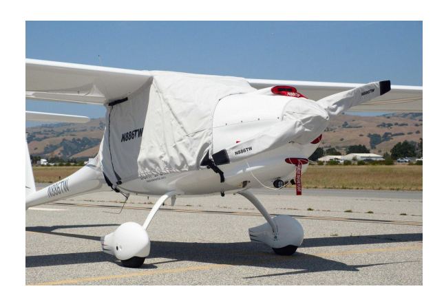
Pipistrel Virus Canopy & Prop Covers, Engine Plugs