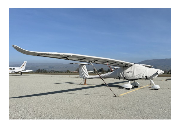
Pipistrel Sinus LSA Full Cover Set

This cover type is made from Silver Acrylic Sunbrella canvas and is 100% lined with a soft and smooth microfiber. Bruce's Custom Covers developed this material combination especially for aircraft protection. The outer material is medium weight and treated for water resistance, UV resistance and anti-static buildup. The inner lining is a very soft and smooth microfiber to prevent scratching. The material is very reflective, and tests show that the cabin interior temperature can be reduced to near-ambient temperature on the hottest of days. It is water, ice and snow repellent, yet breathable to allow moisture to escape from between the cover and the aircraft surface.