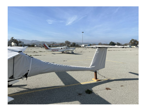
Pipistrel Sinus LSA Full Cover Set