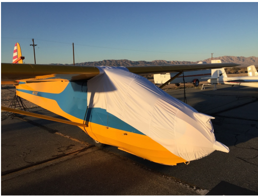
Schweizer SGU 2-22EK Canopy/Nose Cover, test fit cover