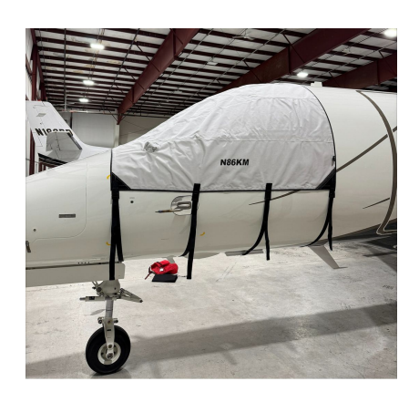
Phenom 300 Cockpit Cover